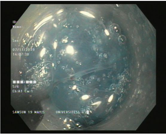
Fig. 2. The appearance of small submucosal vessels during ESD

middle sections of the stomach have a larger diameter, bleeding occurs more commonly in ESDs of these sites (Toyonaga, 2006). The frequency of bleeding increases with greater lesion size (Toyonaga, 2006). However, delayed bleeding is more common in ESDs of distal stomach compared to proximal and middle sections (Oda et al., 2005). The lesion size (Okada et al., 2011), advanced patient age and longer procedure time have been shown to be associated with a higher risk of bleeding. Blood transfusion is rarely needed (Takizawa, 2015). Although it has been reported that a follow-up gastroscopy on the day after gastric ESD decreases the likelihood of delayed bleeding (Goto et al., 2010), it is not widely accepted for routine use. Nasogastric intubation was suggested to be useful in the early detection of bleeding (Takizawa, 2015).