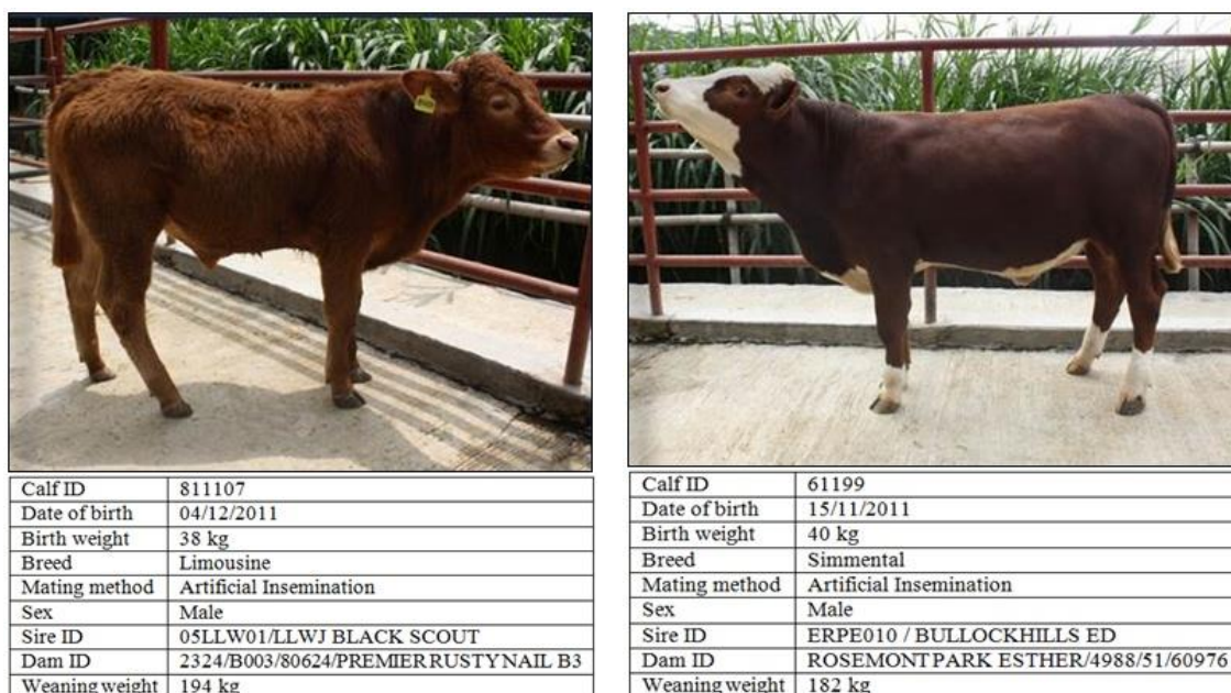
Figure 3. The best Limousine and Simmental candidate bulls at BET Cipelang based on preweaning growth curve of body weight