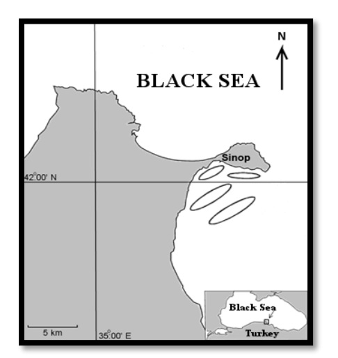
Fig. 2. The sampling points of the study

Sinop region is important fisheries central for the Black Sea in Turkey. Especially, fishermen are use gillnets and trammel nets in the coastal fisheries. Target fish species of the fishing gears are red mullet, whiting, turbot, horse mackerel and bluefish in the area. The most important bycatch species of these fishing gears are scorpion fish, weever, stargazer, gobidae fishes and crabs species respectively. So, the study was carried out in Sinop coasts of the southern Black Sea between 01 January 2015 and 30 September 2016 (Fig. 2).