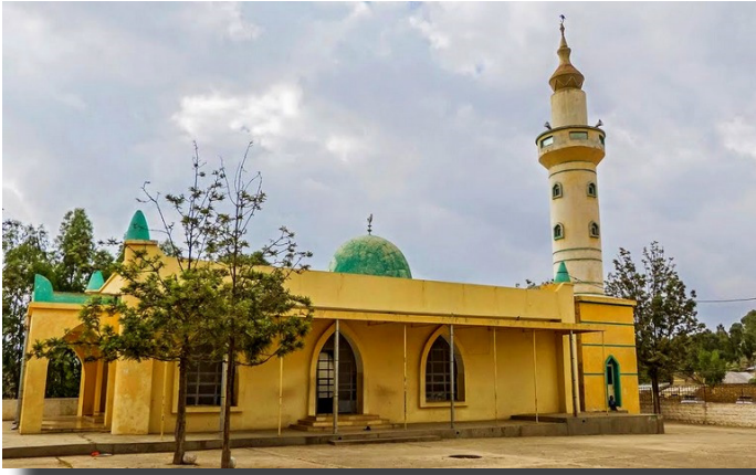
Figure 1. Al Nejasbi Mosque in Tigray, Ethiopia (one of the first Mosques in East Africa).

on Islam as development is seen as Islam in Ethiopia is becoming increasingly radicalised and labelled as a fundamentalism 3 Islam scheme (Baye, 2018, p. 412-427).