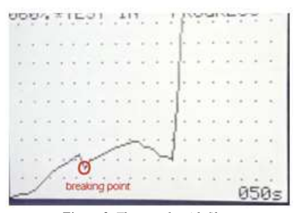
Figure 2. The sample with fibers