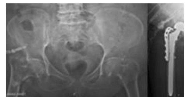
Figure 2. Pre-operative and postoperative radiographs of an 83-year-old patient who underwent hemiarthroplasty.