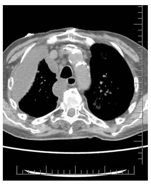
Figure 2: Chest CT-scan demonstrating loculated pleural effusion in right upper zone

ventricular diastolic dysfunction and ejection fraction 40 per cent.