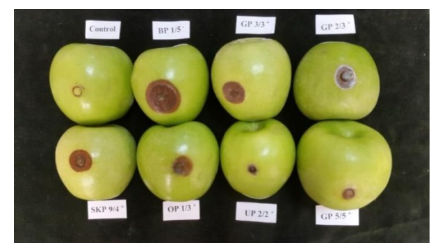
Figure 2. Lesions developed on the 'Granny Smith' apple fruit inoculated with Rhizoctonia solani isolates at the 15th day of inoculation. BP1/5 (dsRNA-free) isolate, GP3/3, GP2/3, SKP9/4, OP1/3, UP2/2 ve GP5/5 (dsRNA containing) isolates

One of the most important signs of hypovirulence is the reduction in virulence of the fungal isolates after infection by viral agent (Ghabrial, 2001). In this study, the two dsRNA positive isolates (UP2/2 and GP5/5) showing low level virulence in apple assay have possibility of being hypovirulent strains. Eventhough apple is not a host, its tissue has been commonly used in the screening of hypovirulent strains of C. parasitica , the causal agent of