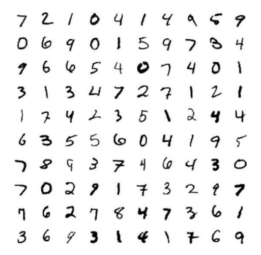
Figure 3. Sample images of MNIST data [13]

All tests within the scope of this study were performed on the PyCharm (v2020.1 community edition), which is an integrated development environment used in programming, specially for the Python language.