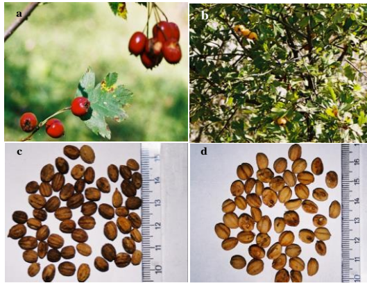
Figure 1. Common hawthorn (a-c) and azarole (b-d) fruits and seeds

pretreatments were completed in the Seed and Afforestation Laboratory of the Forestry Faculty of Artvin Coruh University. The seedling production studies were completed in the forest nursery (aspect: S, elevation: 580 m) of the Forestry Application and Research Center of Artvin Coruh University.