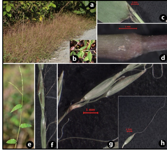
Figure 1. Leptatherum boreale : a-Habitat in Scots pine forest, along the road, b-Young culms, c-Leaf base, d- Glabrous node of culm, e- Upper portion of culm and inflorescence, f, g- Spikelets of pair both unequally pedicelled, h- 1-awned spikelet

UTM: 0602590 - 4531287, KATO 24445! (Figure 1).