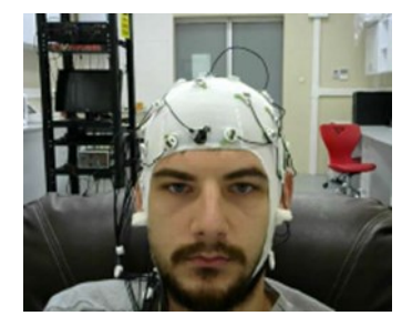
Figure 4. Picture of a subject taken while EEE data is recorded.