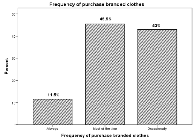
Figure 2. Frequency of purchasing branded clothes in percentage

For this analysis, the significance level is 0.05. If a small p \leq 0.05 , then the null hypothesis will be rejected. This is strong evidence that the null hypothesis is invalid. A large p > 0.05 means the alternate hypothesis is weak, so the null will not be rejected [23].