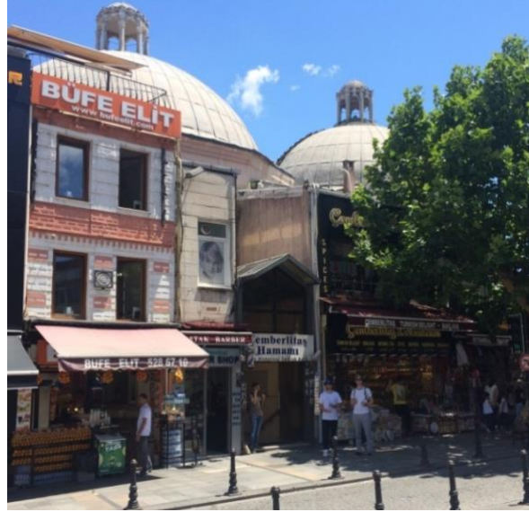
Figure 2. Çemberlitaş Bathhouse

The structural, functional and traditional features of Çemberlitaş Bath was determined that it tried to survive as a traditional Turkish Bath with a deep-rooted historical background. Çemberlitaş Bath is an aesthetic structure that responds to the domed silhouette of Atik Ali Pasha Mosque with its magnificent domes. This situation shows that Mimar Sinan was also a good city planner. However, Çemberlitaş Bath is now surrounded by additions serving as shops. The bath, which was used for disinfection purposes during the First World War, was used as a restaurant and carpet store until 1988 and continued to serve as a bathhouse as of 1988. “Çemberlitaş” is a bath that attracts the attention of foreign tourists mainly due to its historical and traditional nature.