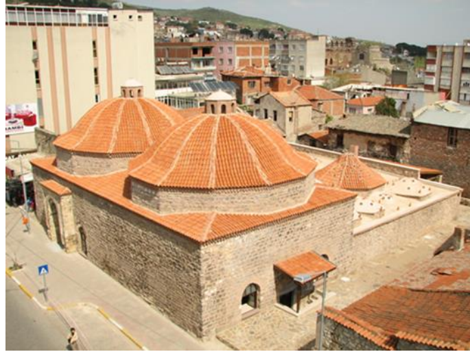
Figure 1. Example of a Turkish bath with a square plan and dome (Bergama Hacı Hekim Bathhouse) (Anonymous, 2016)

There were no hot and cold-water pools in Ottoman baths. However, in hot spring baths there were cold and hot water pools as they were used for treatment purposes and, to make greater use of water. Another difference is that there usually is a pool with a water fountain in the middle of the warm section of Ottoman baths (Büyüktanır, 2009:17). Baths constituted a section of Ottoman social complexes that included mosques, madrasas, hospitals and hospices for public service which served different groups in the Ottoman society and it is seen that these baths had distinct plans and architectural styles that were constant through centuries. Architectural researches showed that bathhouses consisted of several units of square plan with domes which included directly accessible dressing rooms (cold section, undressing section or greenhouse), warm section, hot section that included private bathing sections called halvet and the furnace (Renda, 2012:369). An example of a Turkish bath with a square plan and dome is presented in Figure 1.