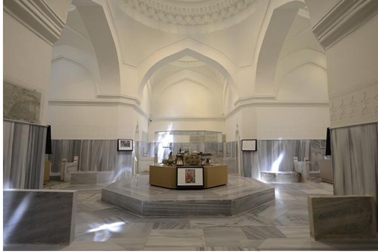
Figure 14. Interior View of the Bayezid II Turkish Bath (Hamam) Culture Museum (Anonymous, 2016h).

Another bath (hammam) museum is the Gaziantep Bath Museum. The building, which has served as the Pasha Hammam for many years, was completed by the Gaziantep Metropolitan Municipality in 2015 and transformed into a museum where Gaziantep bath culture is kept alive.