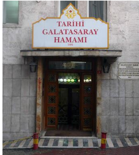
Figure 3. Galatasaray Bathhouse (Yanar’s photo archive, 2017)

The structural, functional and traditional features of Çemberlitaş Bath was determined that it tried to survive as a traditional Turkish Bath with a deep-rooted historical background. Çemberlitaş Bath is an aesthetic structure that responds to the domed silhouette of Atik Ali Pasha Mosque with its magnificent domes. This situation shows that Mimar Sinan was also a good city planner. However, Çemberlitaş Bath is now surrounded by additions serving as shops. The bath, which was used for disinfection purposes during the First World War, was used as a restaurant and carpet store until 1988 and continued to serve as a bathhouse as of 1988. “Çemberlitaş” is a bath that attracts the attention of foreign tourists mainly due to its historical and traditional nature.