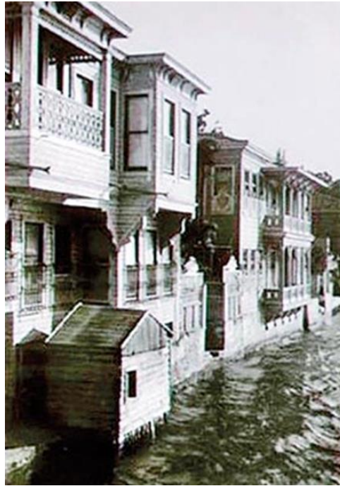
Figure 8. Private Sea Bathhouses in Ottoman Period (Bosphorus/İstanbul) (Anonymous, 2016c).