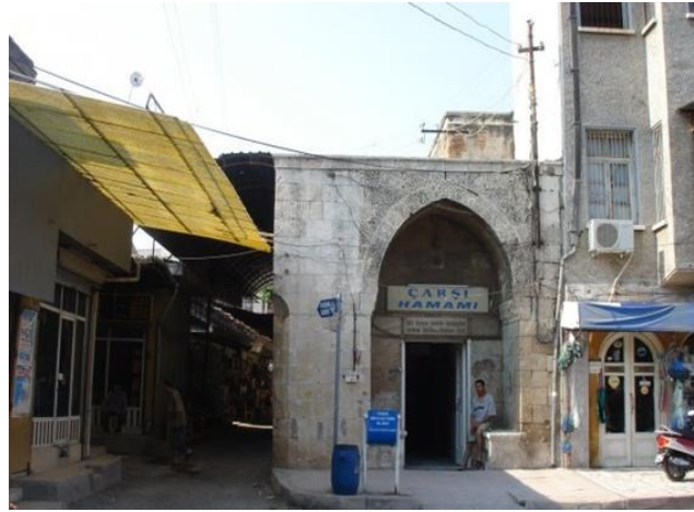
Figure 4. Public Bathhouse (Seyhan/Adana Market Bathhouse) (Anonymous, 2016a).

Turkish baths can be analyzed in four groups in terms of their purposes, namely, public baths, private baths, hot springs and sea bathhouse. Public baths are defined as bathhouses with single or double function which can meet the bathing requirements of everyone (Figure 4). Turkish public baths are usually separated into two as single and double function baths. Single function baths serve to men in certain days of the week and serve to women in the remaining days, usually in low population regions or regions far away from cities. Double function baths are usually constructed in city centers for both men and women to use simultaneously. Double baths, which consist of separate sections for both men and women, have the door of the women's section opening to the side street for women to easily enter and exit. Bathhouses in the neighborhood that are only for women are called " avret " baths and the market bathhouses that are only for men are called " rica " baths (Bozok, 2005:70-71).