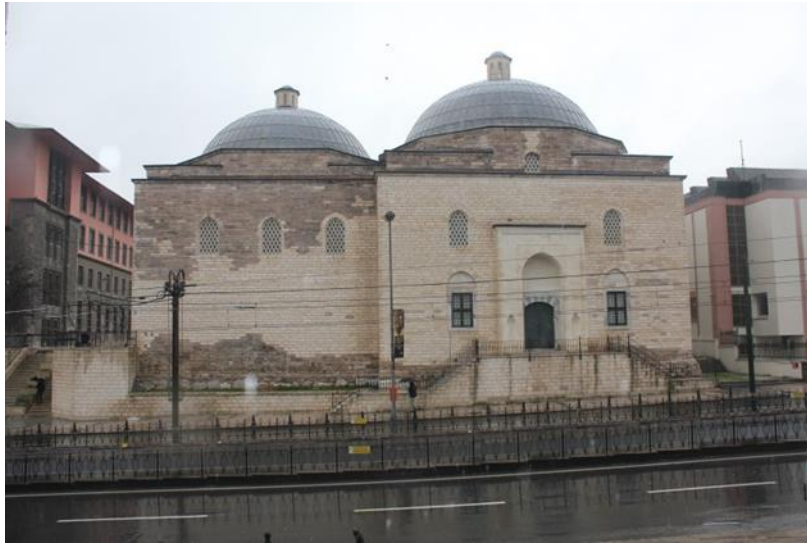
Figure 13. Bayezid II Turkish Bath (Hamam) Culture Museum (Anonymous, 2016g).

Bayezid II Bathhouses, one of the 16 th century Ottoman bathhouses in İstanbul was included into the World Cultural Heritage List by UNESCO in 1985 and was registered as a private museum under the name Bayezid II Turkish Bath Culture Museum in 2015. In the museum belonging to the İstanbul University, ethnographic artifacts belonging to the Turkish bath tradition are exhibited in display cabinets (Anonymous, 2016g) (Figure 13 and Figure 14).