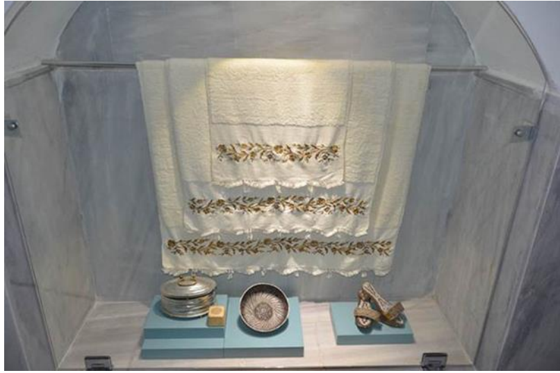
Figure 12. Interior View of the Beypazarı Turkish Bath Museum (Anonymous, 2016f).

Bayezid II Bathhouses, one of the 16 th century Ottoman bathhouses in İstanbul was included into the World Cultural Heritage List by UNESCO in 1985 and was registered as a private museum under the name Bayezid II Turkish Bath Culture Museum in 2015. In the museum belonging to the İstanbul University, ethnographic artifacts belonging to the Turkish bath tradition are exhibited in display cabinets (Anonymous, 2016g) (Figure 13 and Figure 14).