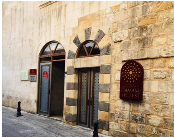
Figure 15. Gaziantep Bath (Hamam) Museum, (Yanar's photo archive, 2020)

Another bath (hammam) museum is the Gaziantep Bath Museum. The building, which has served as the Pasha Hammam for many years, was completed by the Gaziantep Metropolitan Municipality in 2015 and transformed into a museum where Gaziantep bath culture is kept alive.