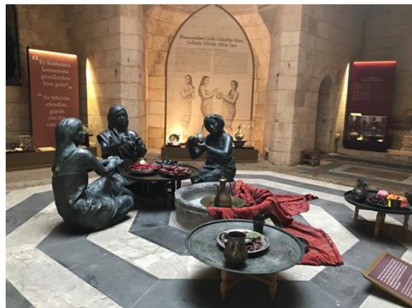
Figure 16. Interior View of the Gaziantep Bath (Hamam) Museum, (Yanar's photo archive, 2020)