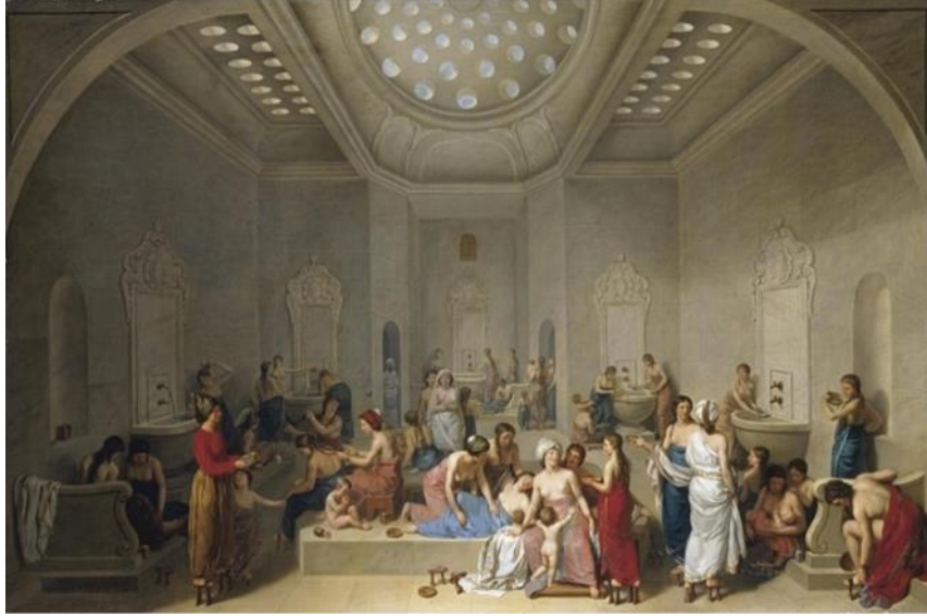
Figure 10. Turkish Women's Bath (J. J. F. le Barbier) (Anonymous, 2016d).