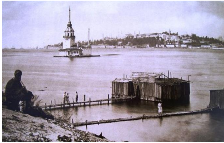
Figure 7. Sea Bathhouses in Ottoman Period (Üsküdar/İstanbul) (Anonymous, 2016c).

waterfront residences (Figure 8). Men were able to go swimming from the bathhouse and exit under the wooden curtain while women were able to swim in the designated section (Emirođlu, 2010:14).