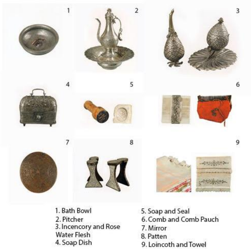
Figure 9. Turkish bath objects (Naim Arnas Collection) (Tofaş Art Gallery, 2009: 127-323).

Bathing bowl, pitcher and basin, censer and rose water vessel, soap box, soap and seal, comb and comb pouch, mirror, patten, loincloth, towel, bath glove can be ranked as bath and cleaning tools (Arlı 1990). These tools and materials take place in Anatolian and Turkish bath culture.