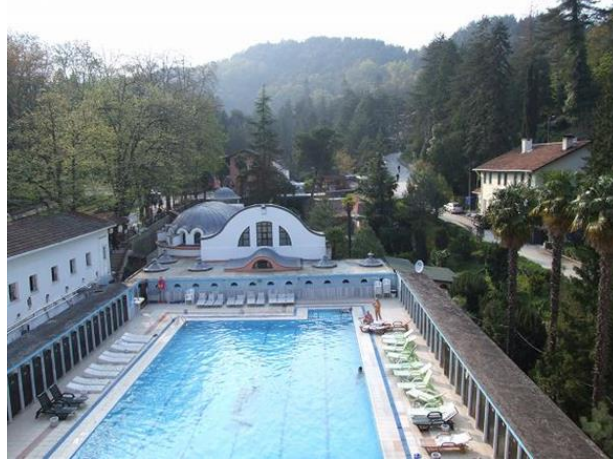
Figure 5. Hot Spring Bath (Yalova Thermal Spring) (Anonymous, 2016b).

Yalova Thermal Springs was formed 4000 years ago because of some natural events. It has become the place where people seek healing for more than 2000 years. During the Ottoman period, it was built by Sultan Abdülmecid (1831-1861). The fact that Bezm-i Alem Valide Sultan, mother of Sultan Abdülmecid, recovered from her rheumatism, made this place famous. Therefore, Sultan Abdülmecid built new bathrooms and mansions here. The fate of Yalova Thermal Springs changed with the arrival of the great leader Mustafa Kemal Atatürk in 1929. Atatürk made great efforts to make it a world-famous health center and water city. Today, Yalova Thermal Spring has a worldwide reputation thanks to Atatürk.