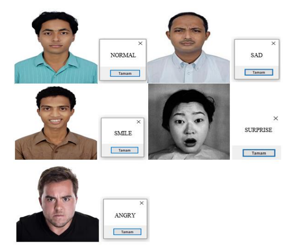
Figure 3. Classification results for each of the images in the image files in the database.

When the operations are carried out in the architecture of the distributed computer system, data on their results are recorded in the database. Saving the result data about the transactions in the database provides the opportunity to be used for analysis. In the distributed computer architecture, information on which computer in the database image files are processed as threads is also recorded.