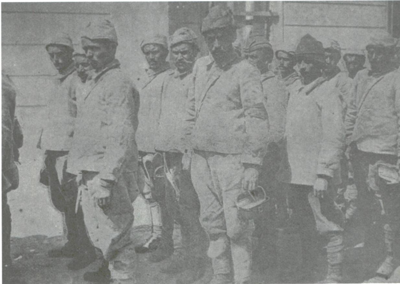
Soldiers of the Ottoman 19 th Division waiting for the meal on the railway station in Cracow on their way to the front