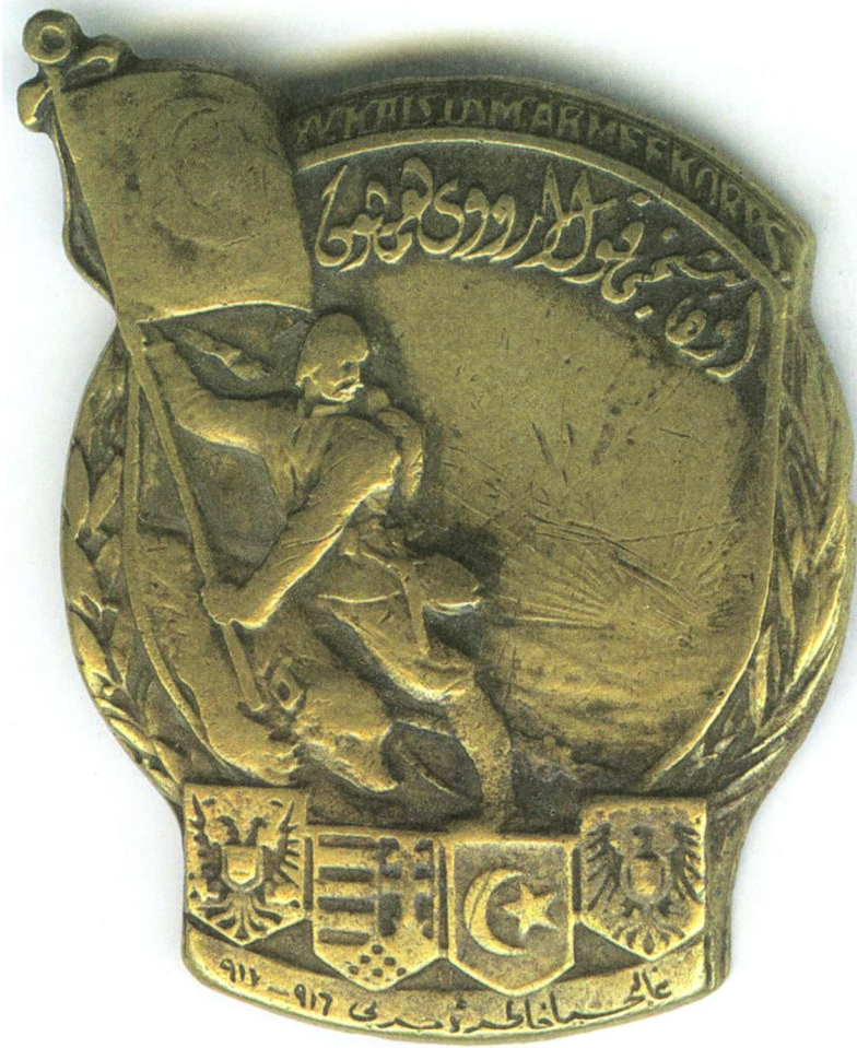
A First World War badge commemorating the participation of the Ottoman 15 th Corps in the engagements along the Galician Front.