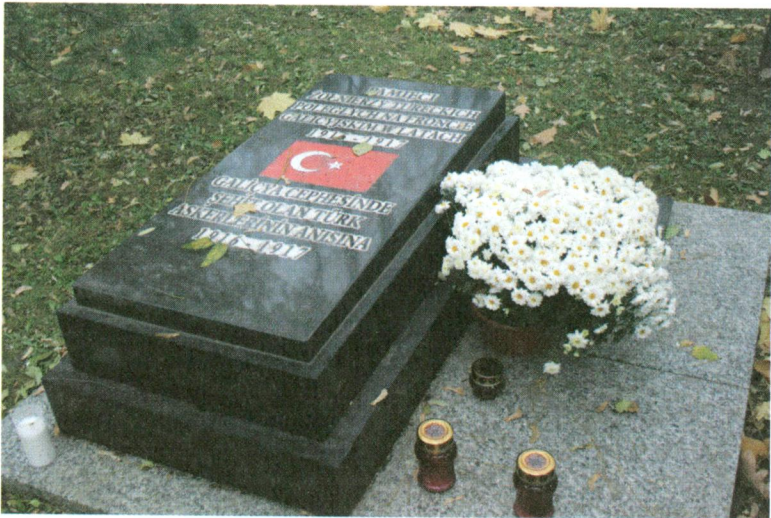
The Rakowicki Cemetery in Cracow. Symbolic grave remembering the Turkish soldiers who fell on the Galician Front. Every year on the 18 th of March there is held a ceremony here to mark the Day of the Fallen (Şehitler Günü), in which participate the representatives of the Turkish Embassy in Warsaw and students and staff of the Cracow Turkish Department.