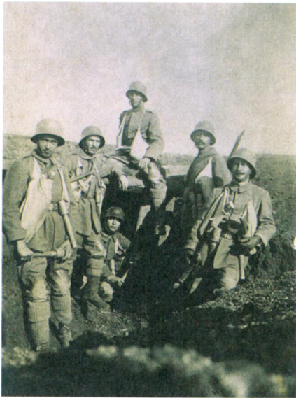
Soldiers from the Turkish assault brigade on the Galician Front