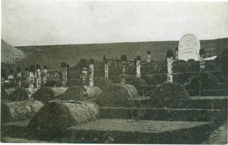
Cemetery of the Ottoman 15 th Corps in the East Galician village of Łopuszna on a photograph taken in 1916 or 1917