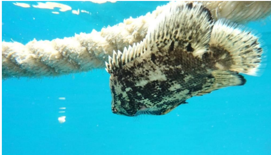
Figure 3. Juvenile Lobotes surinamensis underwater view recorded in the Erdemli coast, northeastern Mediterranean