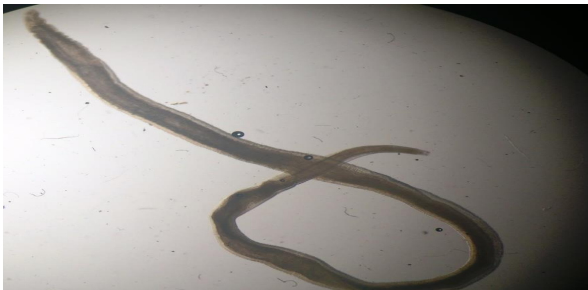
Figure 2A. Hysterothylacium aduncum (♀) (Original photo)

As to the morphology and anatomy of H. aduncum , they are also identified in details by Berland (1989). H. aduncum adults possess a tapering tail without mucron or spicule. The ventriculus short, and the ventricular appendix is longer than the intestinal caecum. The excretory pore opens between subventral lips according to Koyama et al. (1969) and Kikuchi et al. (1970). Body thinner anteriorly. Cuticle transversally striated, lateral alae with support v-shaped in cross-section, starting behind the base of the lips and extending all along the body, becoming narrower posteriorly (Navone et al., 1988) (Figure 2A, 2B). In addition, the reason why that the intestinal caecum of H. aduncum was usually shorter than the ventricular appendix confirmed the relevant literature (Table 3 and 4) (Vidal-Martinez et al., 1994). Morphological characters of female and male H. aduncum were measured and seen to be in harmony with the previous literature, respectively (Table 3, 4)