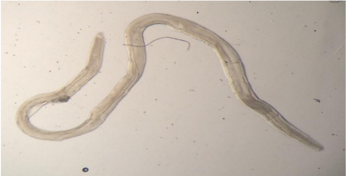
Figure 1B. Anisakis simplex (♀) (Original photo)