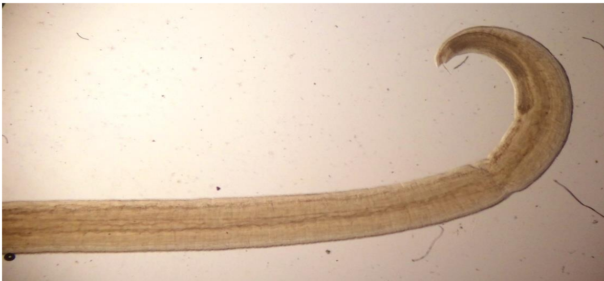
Figure 3B. Posterior part of male Pseudoterranova decipiens (Male)