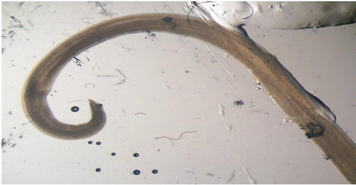
Figure 2B. Posterior part of Hysterothylacium aduncum (♂)(Original photo)