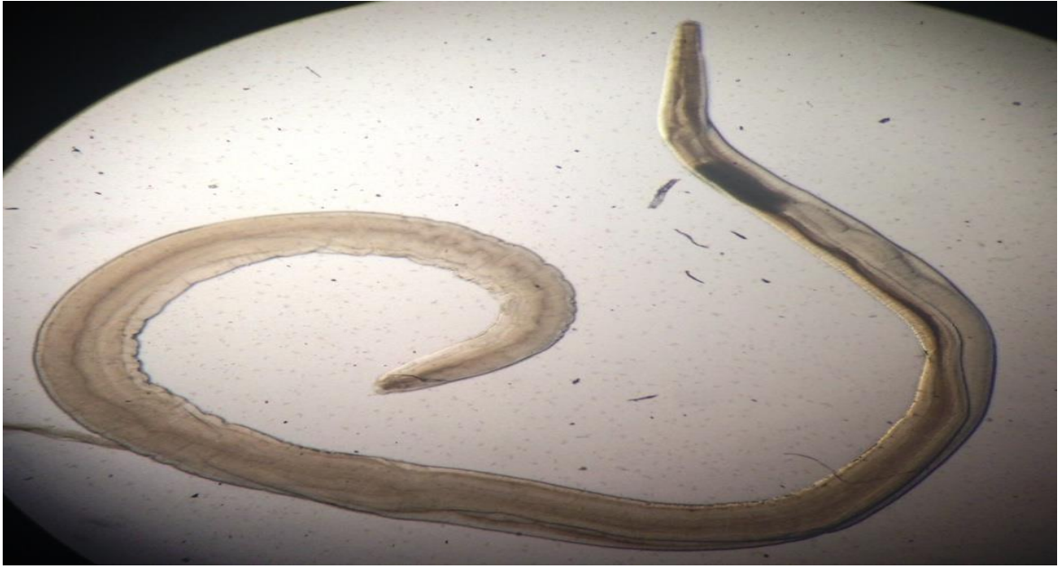
Figure 1A. Anisakis simplex (♂) (Original photo)