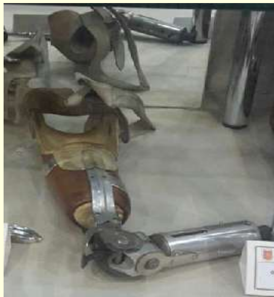
Figure 2. A prosthetic leg sample from the Museum of Gülhane Military Medical Academy

At the beginning of First World War (WW1), the workshops in the Imperial Armory and Imperial Shipyard were moved to Gülhane Clinical Teaching Hospital ( Figure 2 ) and in 1915, the Ottoman State again sent students abroad to training in prosthesis production. Since the loss of limbs would occur as an inevitable consequence of the war, the Austrian Red Cross Society opened a prosthesis course in Vienna. Six students from the Ottoman State were invited to this course by Vienna embassy. The training was free; however, the students would need 250-300 franc per month to cover living expenses. 35,36