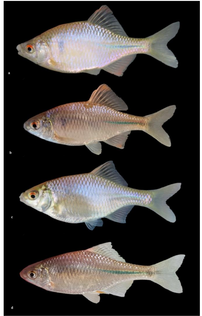
Figure 2. Rhodeus amarus : a. about 62 mm SL; inlet water of Tahtalı Dam Lake; b. about 55 mm SL; Stream Koca; c. about 66 mm SL; Stream Gördeş; d. 60 mm SL; Canal B-20.