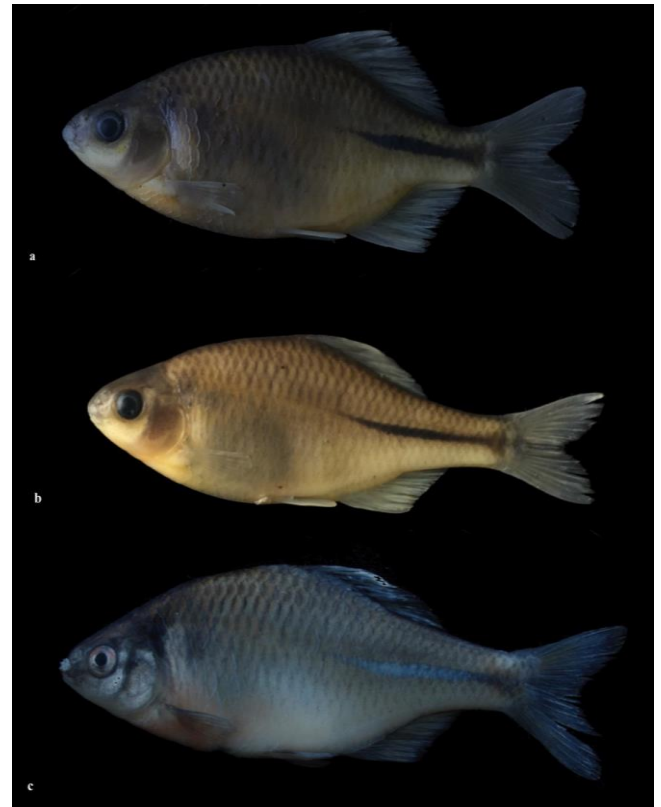
Figure 3. Rhodeus amarus , a. 64 mm SL; Stream (Kara) Menderes; b. 50 mm SL; Ergene River; c. 66 mm SL; Suatugurlu Dam Lake.

et al., 2005; İlhan et al. 2014; Sarı et al., 2019). Also, it was recently recorded in the Aras River drainage (Kaya et al., 2020) (Figures 2-4).