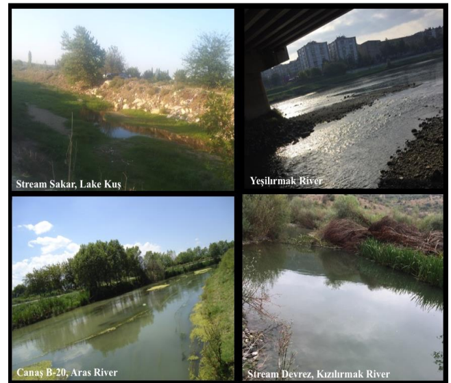
Figure 5. Some typical habitat of Rhodeus amarus .