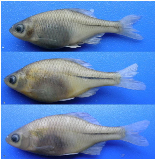
Figure 4. Rhodeus amarus , a. 62 mm SL; Stream Abdal; b. 48 mm SL; A tributary of Büyükmelen; c. 60 mm SL; Stream Terkos.