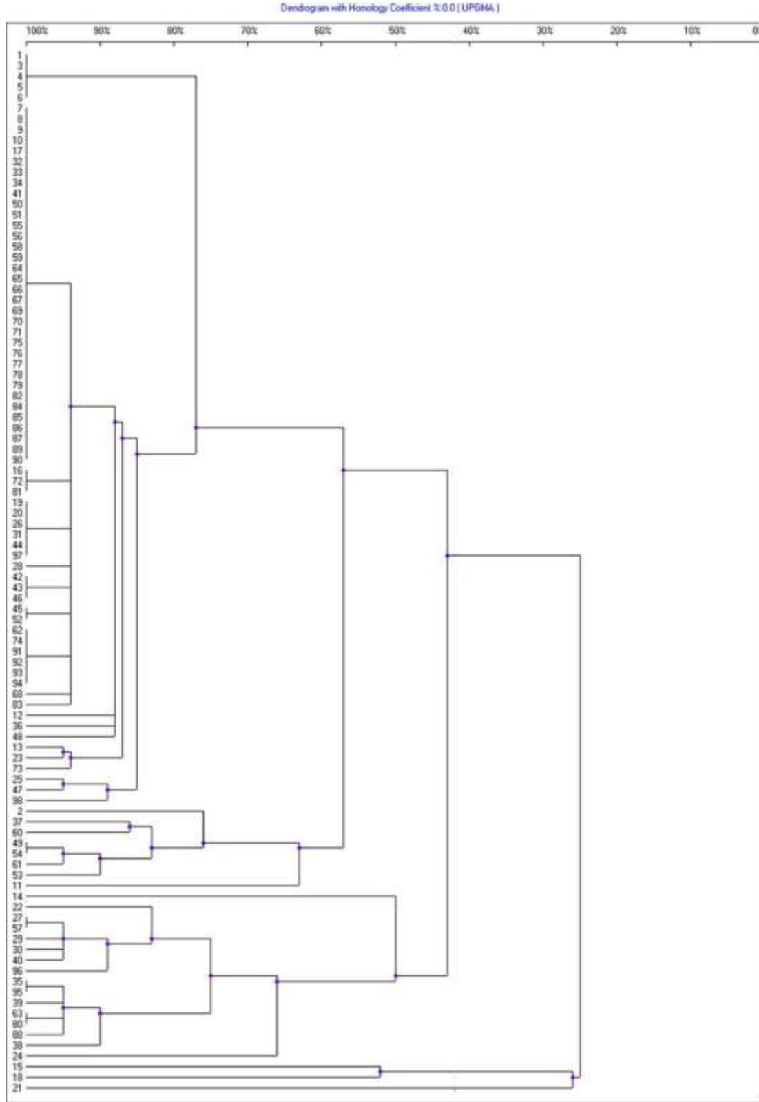
Figure 2. Dendrogram of genetic relationships of S. aureus strains by BOX-PCR

A dendrogram was obtained evaluating the presence or absence of total of 28 bands between ~950-300 bp in Figure 4. According to the dendrogram, while 95 isolates showing genetic similarity by rates ranging between 50-100% are located in the first group, three isolates (15,18,21) forming the second group were separated by 77% from the first group. In addition, the presence of many isolates which were 100% similar in the first group was noteworthy.