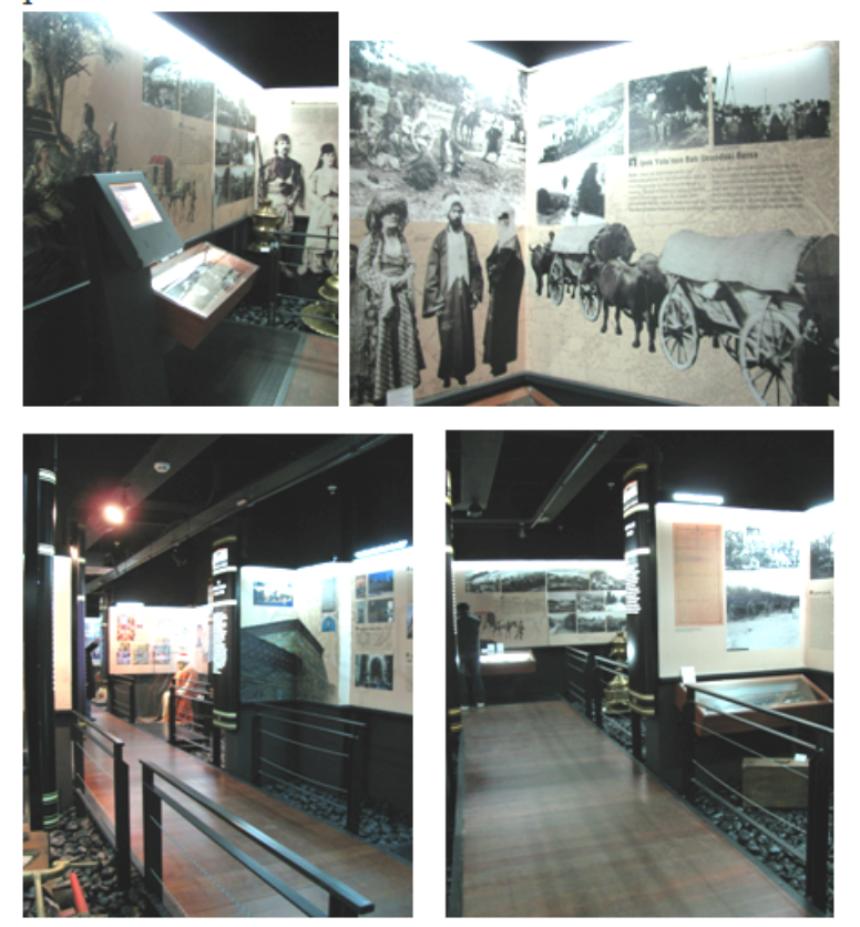
Figure 2: Bursa City Museum, Exhibition Area at Entrance Floor

In the museum, the six wax statues of Ottoman sultans' (who lived in Bursa) are also included (Figure 2). Topographical model of the city of Bursa in the museum gives information about monument works such as Bursa walls, complexes, commercial buildings, baths, and mosques (Figure 3). Besides the exhibition spaces there is an area on the ground floor of the museum that visitors can relax and also a gift shop sales unit is included. At the same time, the museum has the spatial equipment, which provides individuals with disabilities visit the museum. (Ramps, disabled toilets, etc)