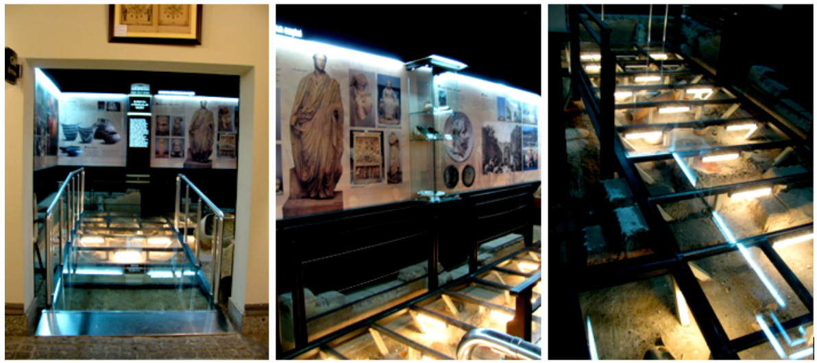
Figure 1: Bursa City Museum, Exhibition Area at Entrance Floor

In the Bursa City Museum, the city's historical, geographical, commercial, socio-economic, and cultural values are represented in chronological order of presentation. Passing into the hands of the Turks in 1326 by Mr. Orhan, and representing being capital of Ottoman Empire, urban planning process began in Bursa with the Republican era. With the development of industry and immigration starting in 1960's, the city's population and urban development has changed rapidly. Today, with the increasing of its geographic location, agricultural, commercial, and industrial capacity the increasing importance of Bursa city has been emphasized in this museum. Configured different patterns compared to traditional museum in terms of both content and format, the museum contains chronological order on the ground floor and thematic narrative. Starting from mound Ilipinar what is remained from BC. 6000 and occurred in Bursa region urban development of Bursa is exhibited in (Anonymity, 2008). The first gallery, which is on the ground floor of Bursa City Museum that consists of three floors, carries the name of "Bursa city of Civilizations." The first civilizations in and around Bursa, consists information about the Bursa that is in the time of War of Independence and Ottoman period. Named as "Contemporary Bursa", the second gallery describes the historical process from the Republican Period to the present (Figure 1).