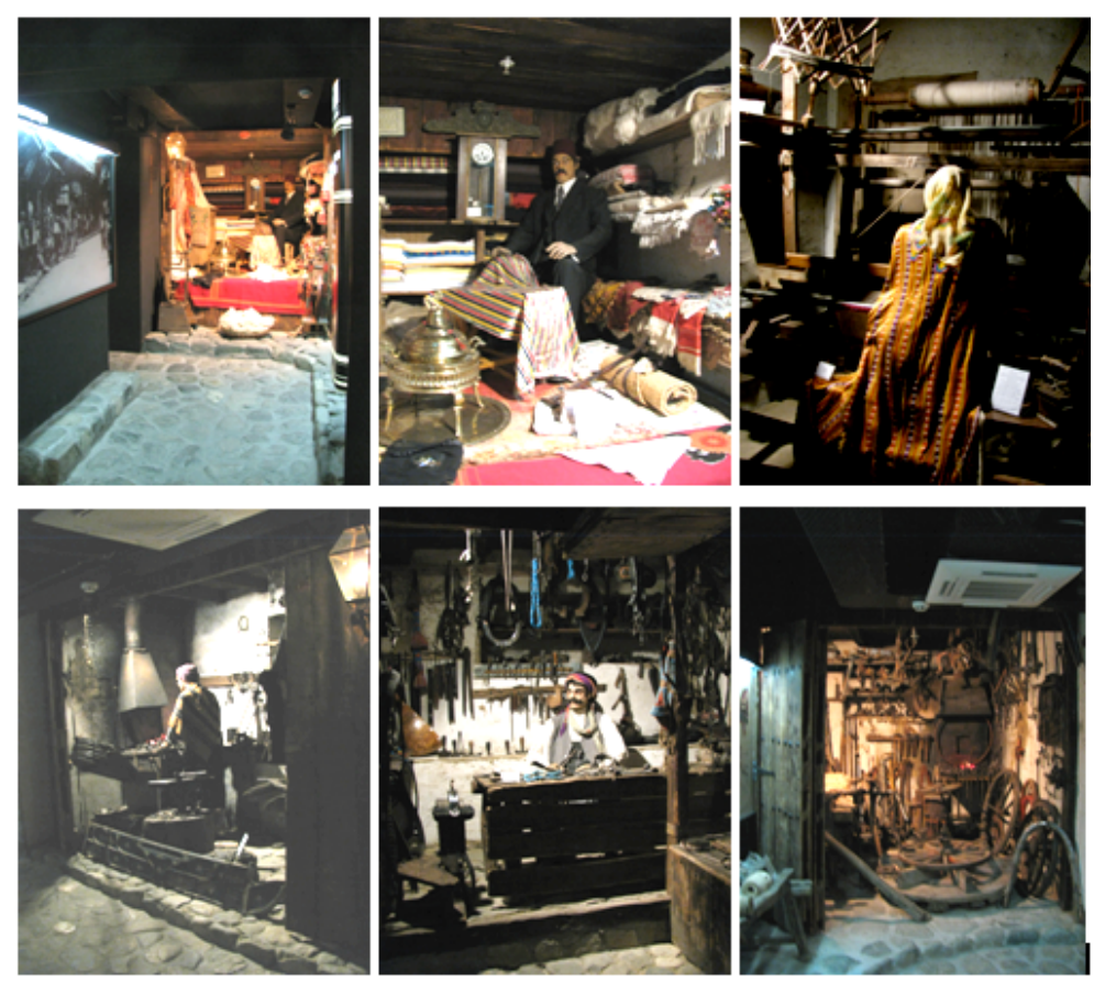
Figure 4: Bursa City Museum, Handicrafts Bazaar Basement Floor

printed head scarf maker, cutler, coppersmith, tinsmith, plumber, carpenter, pad seller, basketware, kebab seller, silk seller, and towel seller display original objects on (Figure 4).