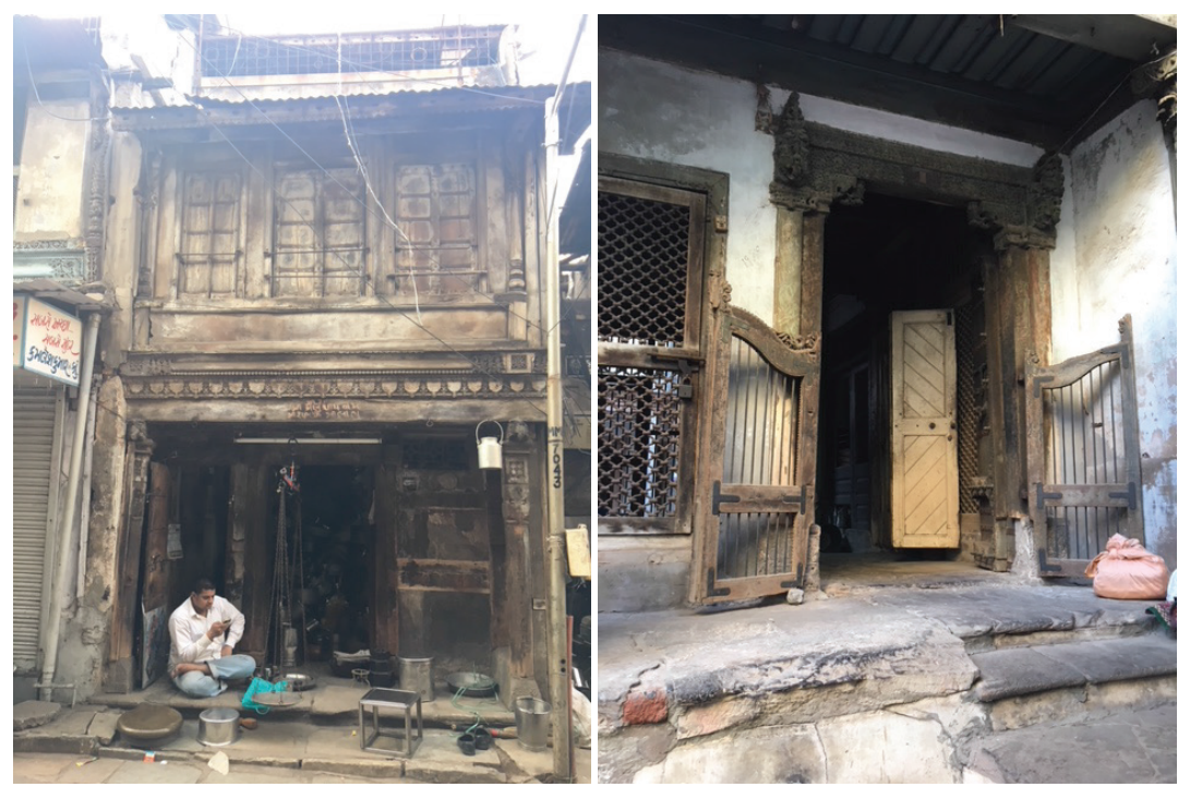
Figure 4 and 5: Typical facades of pol houses