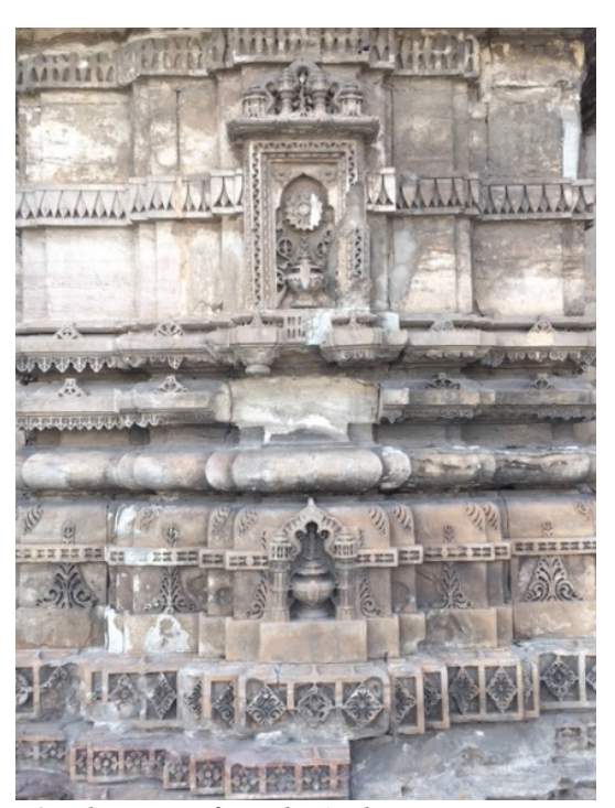
Figure 2. Elements of Hindu Architecture at Jami Masjid

In 1573 A.D. the Sultanate was taken under control by the Mughals. With this, the Sultanate Architecture of Ahmedabad degenerated. In this second half of fifteenth century the Sultanate gave some best examples, these include the Rani Sipri mosque, known for its artistic flowering and Muhafiz's Mosque known for its composition, perspective and filigree work giving it a complete new dimension.