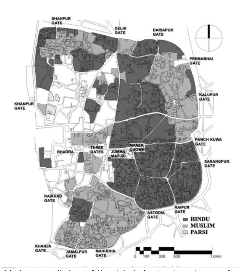
Figure 1. Plan of the historic walled city of Ahmedabad, showing the settlements of various religions

The Sultan, Ahmad Kahn, began with the construction of the Bhadra Fort (citadel), Teen Darwaza (three gates), the Jami Masjid and the Ceremonial Avenue, which connected these main sites of the walled city. It was in the seventeenth century roads and transport networks were built. The area around the citadel was considered ideal for defence and accessibility. Since the Muslim community was dominant at that time, the city was developed in according to the traditions of Islamic City Planning. City's main commercial hub; Manek Chowk was situated near the citadel along with the tombs of Kings and Queens, making it the busiest area of the city. Along the royal complex of the Bhadra Fort, there were many residential areas known as " puras " (pols). These " puras " were residential, self-sustained blocks, which during the eighteenth century became micro neighbourhood houses. It consisted of people from the same community. Each of these " puras " formed a settlement resembling a mound or " Tekra " at the city level [3].