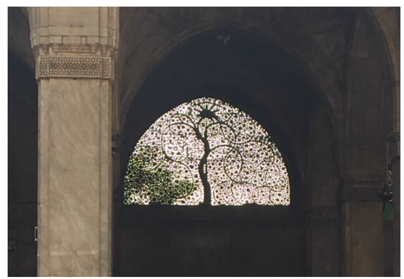
Figure 3. Intricate jali work at Sidi Sayed Mosque