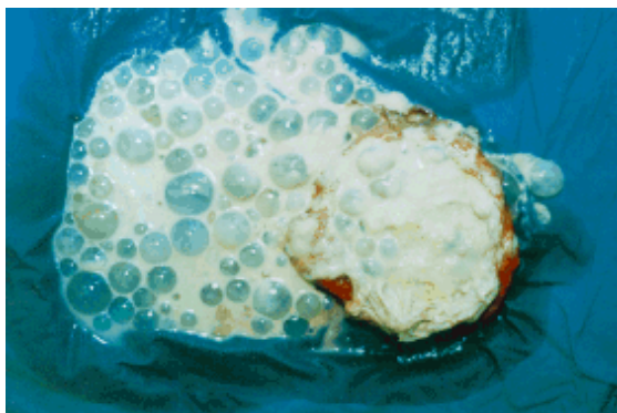
Figure 4. Multiple grape like vesicles and white semiviscous cyst fluid was demonstrated in the mass.