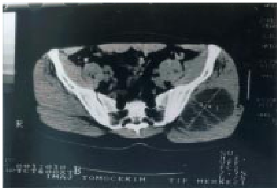
Figure 1. Computerized tomography revealed 8x6 cm cystic lesion with well defined border 2.5cm below the skin in the gluteal muscle.

tomography confirmed these findings (Figure 1). Fine needle aspiration of the cystic mass revealed only neutrophils in moderate amounts. Bacteriological cultures were also negative.