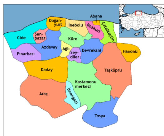
Figure 1. Kastamonu (Hanönü) Region (Anonymus, 2020).

The center of the city is in the city of Kastamonu with the same name. 74,6% of the face measurement of Kastamonu province consists of mountainous and woodland, 21,6% plateau and 3,8% plains. In general, there are large areas suitable for agriculture. Small plains, which take an important place in the valleys, are treated as important areas where such operations are carried out. The district of Alan Hanönü, which is a branch of Kızılırmak, is located in Taşköprü district, Sinop province Boyabat district, which is connected to many towns until 1988.