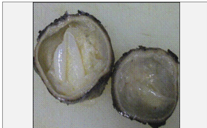
Resim 3. Kitle içinde jermatif membran

It is difficult to diagnose primary intermuscular hydatid cyst except for endemic areas. Abscess, hematoma, soft tissue tumor and other lesions should be considered in the differential diagnosis. Biopsy should not be performed, since it would be