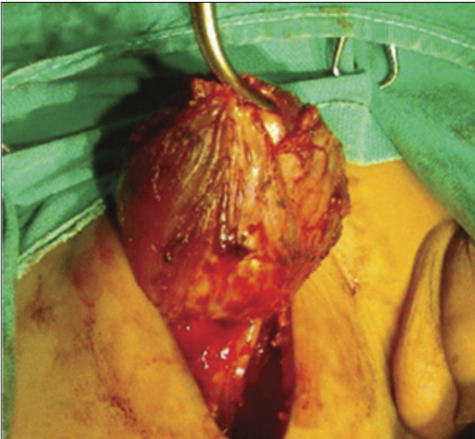
Resim 2. Kitlenin tümünün çıkarılışı

The cystic mass was excised completely without damaging the mass (Picture 2) and the area was rinsed with hypertonic saline. Afterwards, the mass was opened and it was observed that germinative membrane and hydatid fluid were present (Picture 3). No problem occurred postoperatively. The patient was given 10 mg/kg/day albendazole for three months.