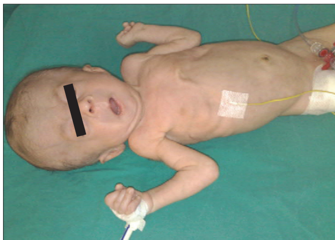
Picture 1: General appearance of the infant diagnosed as Edward's syndrome

The infant was internalized in the neonatal intensive care unit and intubated. Ventilatory support was provided. Esophageal atresia and accompanying tracheoesophageal fistula were corrected adequately. No problem related to the operation was experienced. Patent ductus arteriosus was closed by giving oral ibuprofen. Lung infection and cardiac failure developed during the follow-up. Although appropriate antibiotics and inotropic treatment were administered, full recovery could not be achieved and oxygen requirement persisted. The infant was referred to a secondary care neonatal unit for maintenance of care and treatment on the 102nd day of life by receiving informed consent from the family. Genetic consultancy was provided for the family.