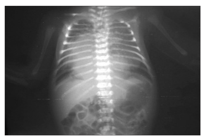
Picture 1. Consolidated, well-defined mass localized in the right and left paracardiac regions on chest graphy and corpus defects in T3, T4 and T5 vertebrae