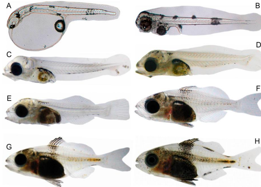
Figure 2. Ontogenic development of D. puntazzo : A, 1 DAH at 2.88 mm TL; B, 4 DAH at 3.36 mm TL; C, 10 DAH at 5.12 mm TL; D, 15 DAH at 5.98 mm TL; E, 24 DAH at 7.96 mm TL; F, 30 DAH at 11.43 mm TL; G, 37 DAH at 13.62 mm TL; H, 42 DAH at 16.08 mm TL.

presented at 7.98 \pm 0.72 mm TL on 24 DAH. Melanophores and xanthophores were visible on the head, cephalic and pre-hemal region (Figure 2E). The dorsal, anal, caudal, and pectoral fin shapes began to develop on 24 DAH. D. puntazzo larvae were 11.42 \pm 0.86 mm TL at 30 DAH. Punctuate and puncto-stellate melanophores and xanthophores shown on the head, cephalic and pre-hemal region (Figure 2F). At 37 DAH, melanophores and xanthophores increased on trunk, mainly on notochord, dorsal and anal fins at 13.50 \pm 1.54 mm TL. In addition, vertical lateral bands were characterized between dorsal and anal fins (Fig. 2-G). Larvae were 16.03 \pm 1.74 mm TL on 42 DAH, which is the end of the study. Punctuate and small stellate melanophores were visible all over the trunk, mainly in the head and around the fins except caudal fin (Figure 2H).