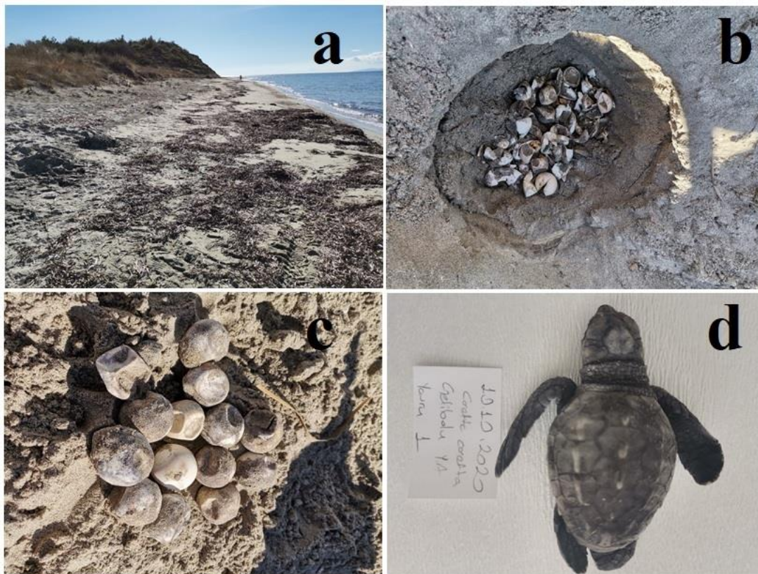
Figure 2. Some photos of the recorded nest on the Gelibolu Peninsula (a: The Kum Beach, b: nest depth and empty eggshells, c: unhatched eggs, d: a dead hatchling).

The Kum Beach (Kabatepe, Ecebat, Çanakkale) is located on the Northern Aegean, opposite to Gökçeada island on the east of Gelibolu Peninsula. The beach has yellow-coloured sand, and its average width is 20 meters with a maximum width of 35 meters (Figure 2a). The distance from the sea to the nest is 14 meters, and the distance from the nest to vegetation is 8 meters. Also, total nest depth (from top to bottom) measured was 46 centimeters (Figure 2b). A total of 74 eggs were counted in this nest, and only 50 of them produced hatchlings. Hatching success was calculated as 67.5% (empty eggshells/the clutch size X 100). The remaining 24 eggs, (unhatched eggs) were identified, and include seven early-stage embryos (9.46%), 17 late-stage embryos (22.97%) and one unfertilized egg (1.35%) (Figure 2c). Forty-six hatchlings reached the sea safely while four hatchlings were found dead either the inside or the outside of the nest (Figure 2d).