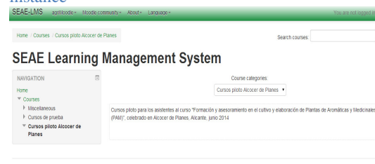
Figure 3. The SEAE Herbal.Mednet agriMoodle instance