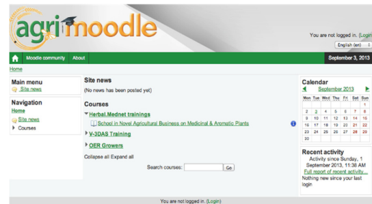
Figure 2. The main Herbal.Mednet agriMoodle instance

The vocational curriculum developed by Herbal.Mednet project consists of different training modules: M1 – Pedagogy, M2 – Technology, M3 – Business Ideas, M4 – Principles of organic agriculture and organic MAPS, M5 – Legislation and Standards, EU policies and programs to support organic MAPS, M6 – Organic MAPS cultivation, M7 – Marketing organic MAPS products - Packaging -Trade, where each module consists of various units.