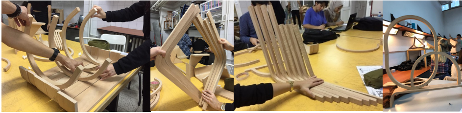
Figure 3: Students' mentions coded as "experiments for joinery"

The mentions (n=66) under title "Things that we have learnt" surprisingly have more mentions (n=19) than expected for power tools. Students mentioned power tools names and their specifications and explained how they work. Material knowledge is mentioned (n=10) as expected. Students also mentioned how they get familiarized (n=10) with residual pieces.