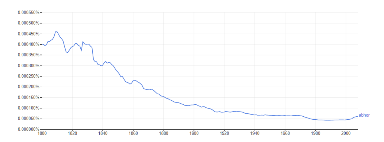
Figure 6. Analysis of Change in the Frequency of Using Abhor (Google Books Ngram Viewer, 2019)