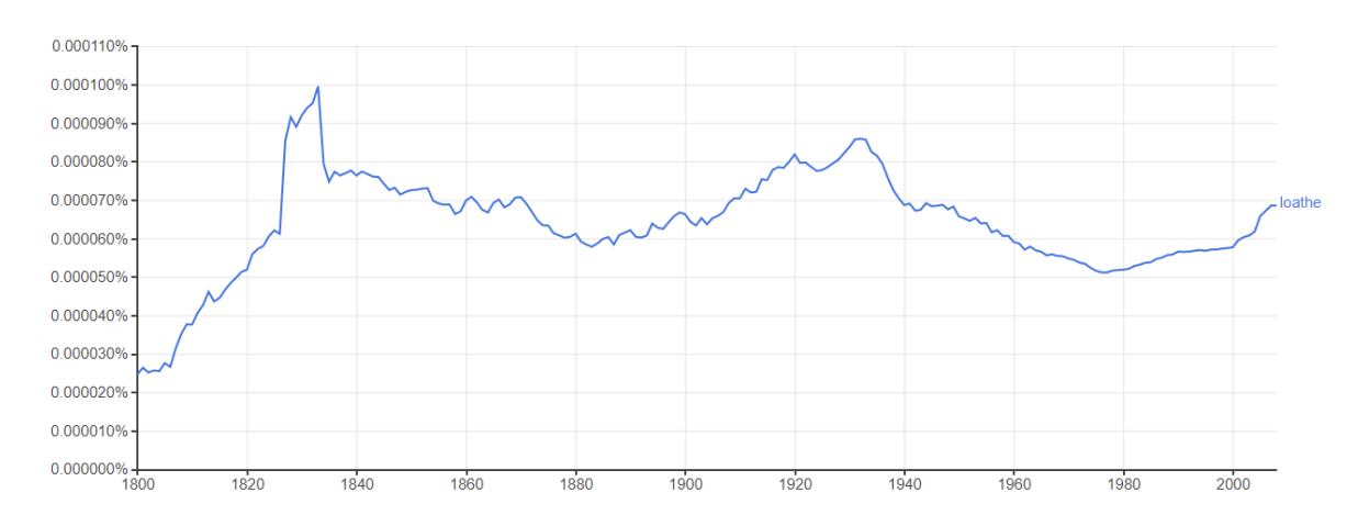
Figure 7. Analysis of Change in the Frequency of Using Loathe (Google Books Ngram Viewer, 2019)

When the participants' overall scores in terms of their correct scale construction were examined, as shown in Table 4, only 7 pre-service teachers could construct a correct scale for fear-type emotion verbs (18.4 %) and 1 pre-service teacher could construct a correct scale for disliking verbs (2.6%). However, more than half of them could construct a consistent scale for liking verbs. Similarly, instructors performed poorly in terms of their correct scale construction for fear-type (36.4%) and disliking verbs (27.3 %) but performed better for liking verbs (63.6%). Native speakers could construct better scales for fear-type (70%) and liking verbs (90%). However, 60% of them could not also construct correct scales for disliking verbs. It was seen that the worst performance was observed in scale construction for disliking verbs among all participants.