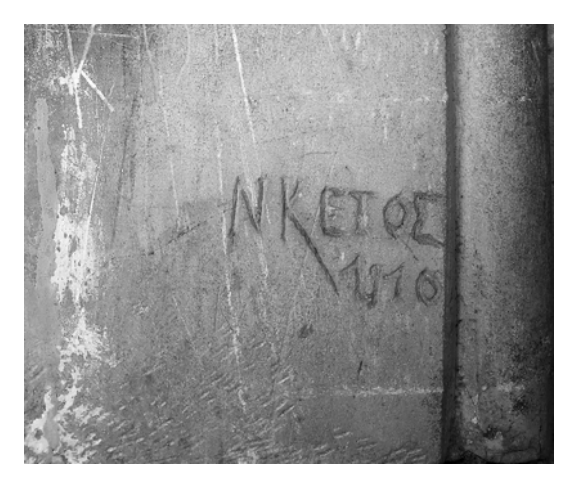
FIG. 5 Graffiti on the exterior of the Alaeddin Mosque - NKETO \Sigma | 1910.