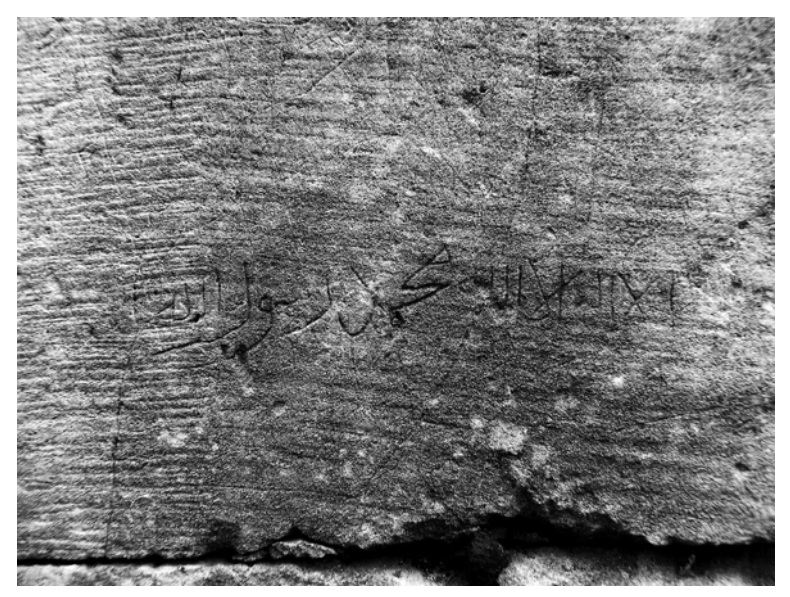
FIG. 2 In the middle face of the left side front of the portal -The Islamic phrase in Arabic letters - La ilahe illallah Muhammeden Rasulullah.