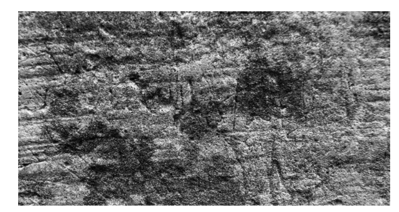
FIG. 1 Islamic phrase in Arabic letters on the left side front of the portal -La ilahe illallah.