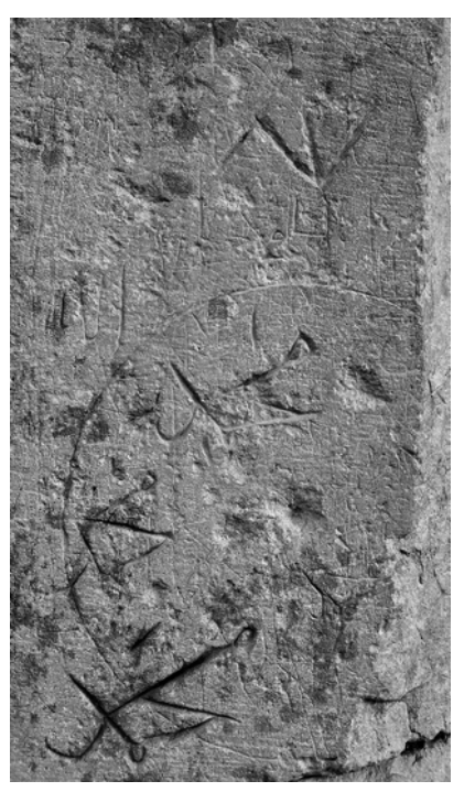
FIG. 4 Inscriptions and figures in the middle of the left inner side of the portal - A stone mason's mark and the words, Allah and Muhammad in Arabic letters.