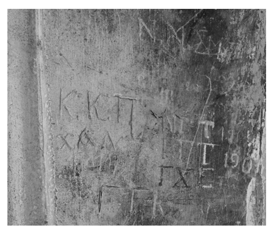
FIG. 7 Graffiti on the Alaeddin Mosque - miscellaneous Greek letters and Arabic numerals.