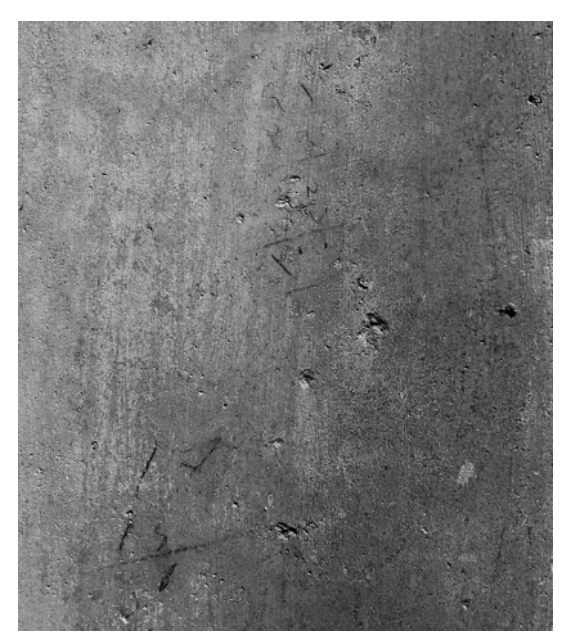
FIG. 9 Records written in Ottoman Turkish on the front face of the left side of the door frame of the entrance to the Yenikapı Hamamı (Bathhouse).