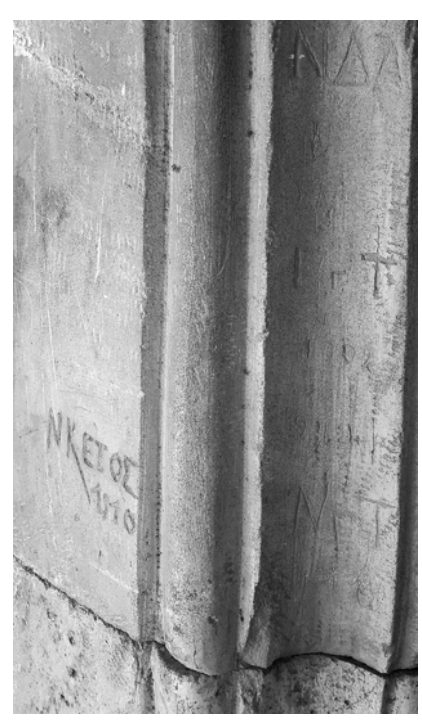
FIG. 6 Graffiti on the Alaeddin Mosque - N\Delta\Delta & ET & NT as Greek Letter Combinations and Arabic Numerals Indicating the Year 1909.