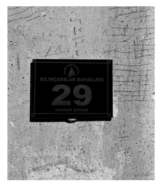
FIG. 8 Records written in Ottoman Turkish on the front face of the right side of the door frame of the entrance to the Yenikapı Hamamı (Bathhouse).