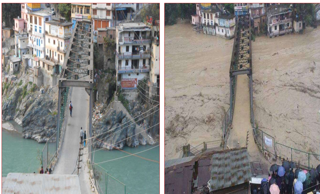
Fig. 3. Water level of Alaknanda River at Rudraprayag just upstream of its confluence with Mandakini River before (left) and after June 2013 floods (right)

Glacial lake outburst floods (GLOFs), resulting from the sudden release of water from lakes impounded by moraine or ice dams, can be a major hazard in high mountain areas (Khanal et al., 2015). Characteristically, glacier dammed lakes can be classified as moraine dammed and glacier dammed lakes - dammed either by active glacier masses or debris-covered icemasses with or without contact with the active part of the glacier (Grabs and Hanisch, 1993). The same evolve into debris flows by erosion and sediment entrainment while propagating down a valley, which highly increases peak discharge and volume and causes destructive damage downstream (Liu et al., 2020). In the summers of 2013, the state of Uttarakhand received abnormally high precipitation that resulted in sudden rise in the level of most rivers and streams (Fig. 3).