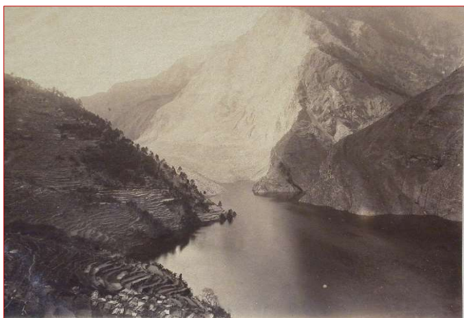
Fig. 2. Gohna Lake formation on Birahi Ganga due to rock fall/slide

Rudraprayag district due to major rock fall/slide. The flow of the Madhyamahewar River was blocked for about 12 hours due to the forming of a natural dam. Later the breached dam caused damages and distractions to downstream. On the other hand, on 18 th August, 1998 the massive rock fall was triggered and detached huge rock mass overran the Malpa habitation which was situated just downhill side of the event in the Dharchula tehsil of the Pithoragarh district. This landslide mass was also blocked the flow of the Malpa gad temporary.