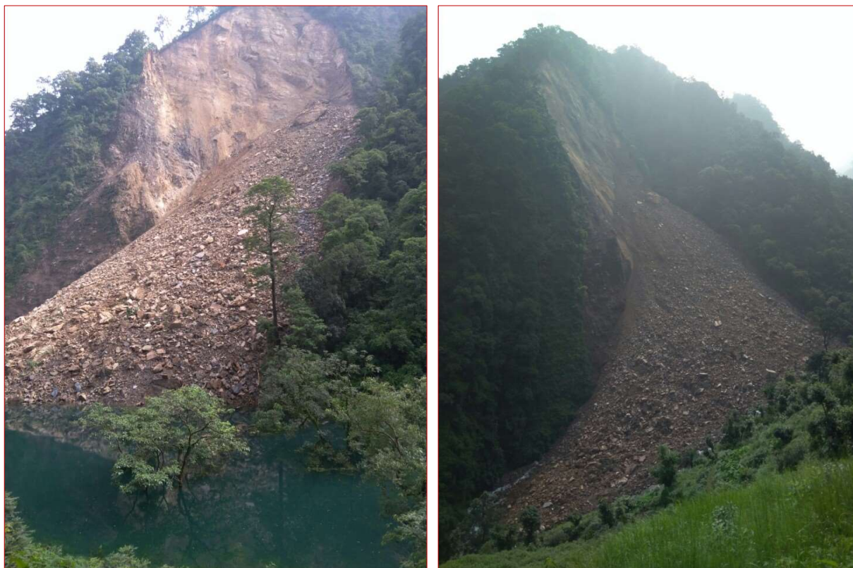
Fig. 6. The lake formation by landslide dam (left) and downstream view of landslide (right) at Lwarkha in Chamba tehsil of Tehri district