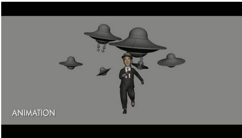
Image 2. Silent short animation film, sample of pre-application of 3D modelling 11

Oldenburg, Animation Staff of Silent, are commenting on Silent: “ We could not have time to make miniatures of characters and space of Silent due to limitation of time. But in past, we worked with miniatures on Mr. Morris Lessmore’s Fantastic Books or Chipotle. In this case, visual elements of the film should look like miniatures. It can be said that our miniature experience of Mr. Morris is applied to computer this time.” 10 As Dean and Oldenburg noted, the role of computer graphics gains importance and computer becomes the reflection of real-life or objects in computer aided animations.