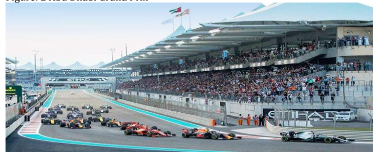
Figure: 2 Abu Dhabi Grand Prix