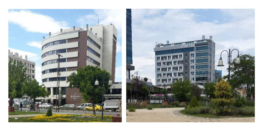
Figure 6. Left: Dedepark Hotel which is erected in the place of Fil Tile Factory; Right: Modernity Hotel a newly introduced building along the street with a retail function on the ground floor (Kolsal, June 2016)

In line with Banerjee, it is observed that İsmet İnönü-2 Boulevard has open spaces both publicized private identity and privatized public identity. In his paper, defining the "openness of the open space", Lynch (1990: 21) sets the criteria for a good and public open space. Starting from the very meanings of the word "open", he starts a semantic and linguistic discussion in order to better describe the space. Openness can be the accessibility as well as not being closed. Whatever it is, according to Lynch, open space he is describing should be public and determined by some building blocks.