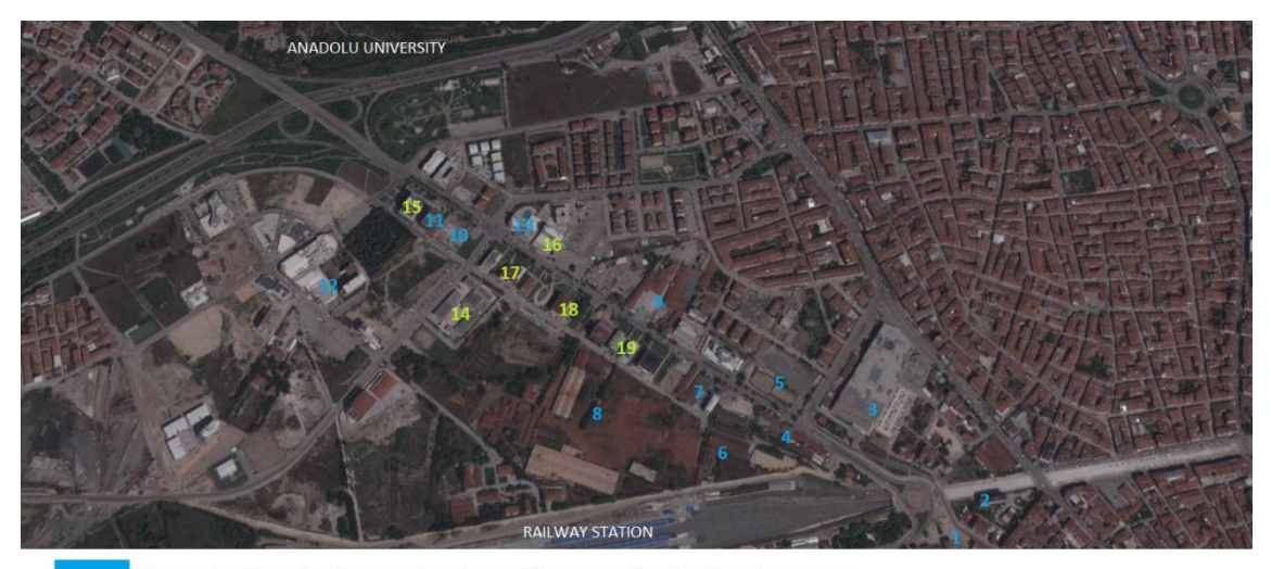
Factory buildings/settlements transformed for some other functional purposes New buildings erected in the district

The transformative actions have started after the municipal decisions assigned a new function for the area. It is the turning point of the region in terms of getting out of an identity related to production and gaining a recent one related to consumption. There is no doubt that urban decisions have great effect on the formation of a city (Benliay et al., 2015: 40). The most striking development and the signal for a change were the introduction of the tram to the urban circulation of Eskişehir in 2004 (www.eskisehir.bel.tr), which at the same time passed through İsmet İnönü-2 Boulevard. By this way, the accessibility of the street has increased. However, the following two occurrences had an incomparable effect on the progress of the street: the opening of two shopping malls in 2007; Kanatlı and Espark Shopping Malls successively (Üstün and Tutal 2008: 272).