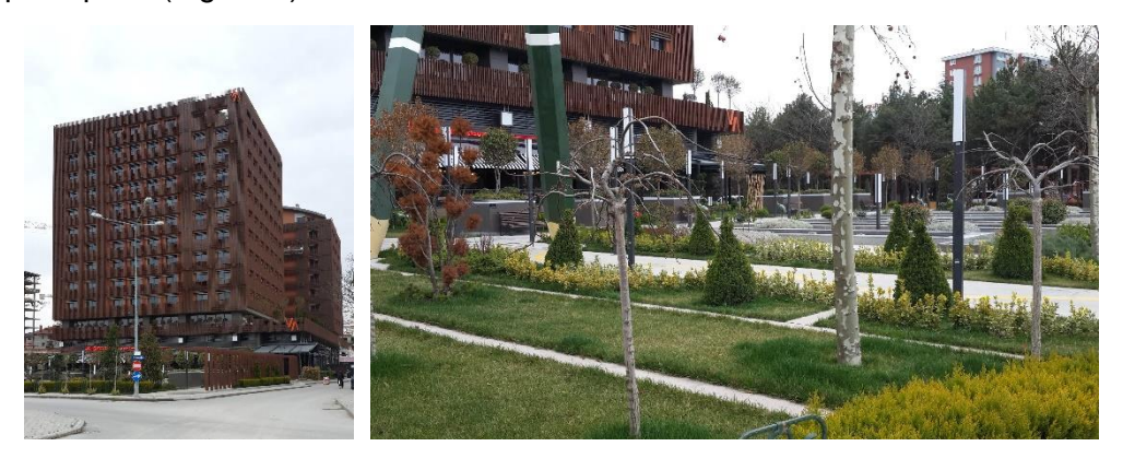
Figure 7. One of the office blocks (Iki Kule and Hilton Hotels) on the street and the open space in front of it, the ground floor has a retail function as a pub and cafe (Kolsal, 2016)

With respect to these definitions, the open spaces in between office blocks having access from the street and the retail spaces on the ground floor of the blocks can be counted as open public spaces. However, their connection and vicinity to the private third places render those open spaces privatized and create an invisible boundary. Especially, the open space in front of "Iki Kule" (Two Towers), is a good example for this since it has a complementary design with the building blocks behind. It gives the impression that it belongs to the proprietorship, not to the public, even if it is an open space (Figure 7).