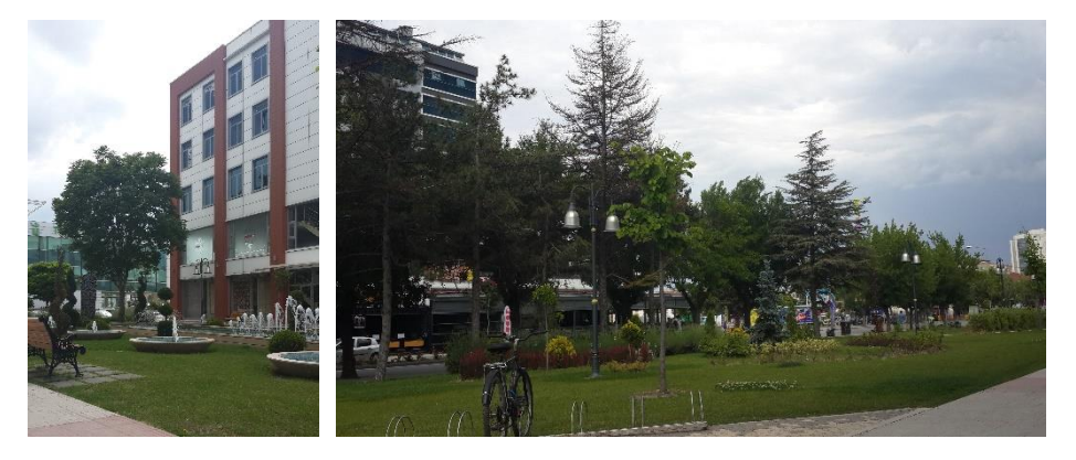
Figure 8. Commercial buildings and the hotel called "Modernity" (Kolsal, 2016)

some public messages, yet they are far from being defined and publicized since they serve as the backyard or front yard of the third place they are adjacent to (Figure 8).