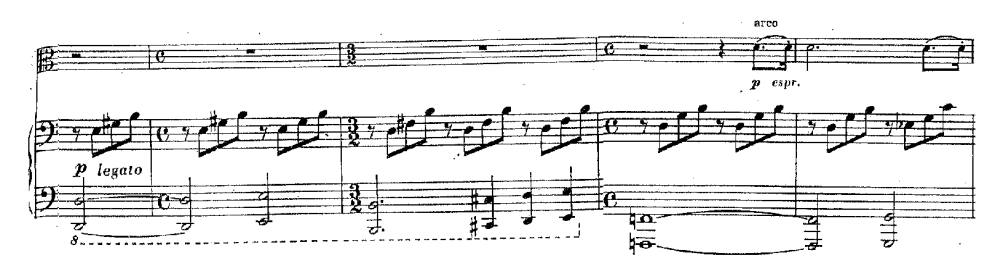
Figure 19. Shostakovich, Sonata for Viola and Piano Op. 147 (Score), 3rd movement bars 13-17 (Shostakovich, 1975, p.34)

Finally, the third movement is informally subtitled "in the memory of the great composer" and presents the most substantial part of the sonata. Especially the compositional style in this movement is of particular interest, with it being fragmented largely due to the number of quotations ranging from Beethoven's Moonlight Sonata (Figure 19) to self-quotations from many of Shostakovich's own symphonies (Wilson, E., 2012: 83-94).