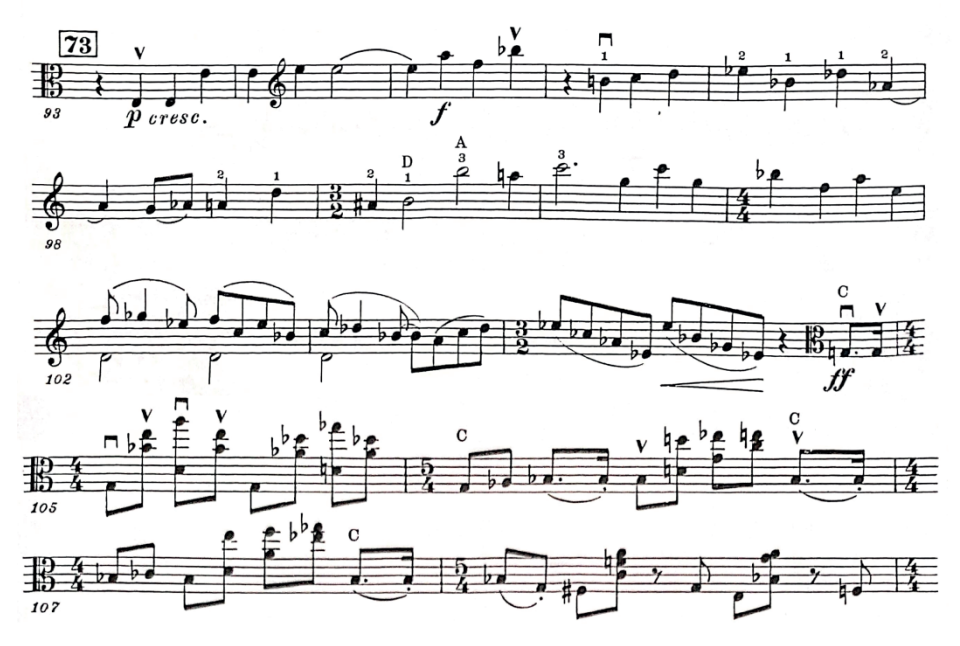
Figure 20. Shostakovich, Sonata for Viola and Piano Op. 147, 3rd movement bars 93-108 (Shostakovich, 1975, p.14)

The following solo passage shows a great example of evolution through a wide range of dynamics from piano to forte leading to the section of explosions with dynamics marked fortissimo supported with double stops and triple stops written in viola. In Druzhinin's viola part all the bowings and fingerings are precise and can be taken as a reference when interpreting the section. It can be seen that he chose to play the bass-line passage starting from 104 on the C string to keep the power and the tension (Figure 20).