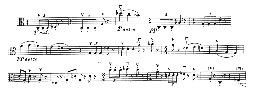
Figure 10. Shostakovich, Sonata for Viola and Piano Op. 147, 1st movement bars 222-237 (Shostakovich, 1975, p.6)

these different ideas by interpreting the staccato parts as dryly as possible and off the string, while playing the dolce parts with a fluent bow in a resonating way. In Druzhinin's viola part it can be seen that he has chosen to play the staccato triplets starting with up bow and the dolce parts are played with down bow (Figure 10).