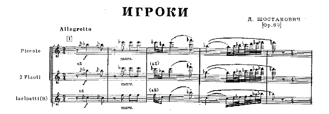
Figure 11. Shostakovich, The Gamblers Op. 63, Allegretto bars 5-7 (Shostakovich, 1981)

The examples below explain how to interpret the specified passages with the suggested bowings given by Fyodor Druzhinin, the dedicatee of the work. To imitate the sharp articulation of upper wind instruments, the violist can use light and extra short repeated up bows when playing the staccato notes. In addition, to achieve the screaming effect of the quick crescendo at bar 6, the player should start the passage on an up bow with a very soft dynamic and increase the pressure gradually whilst increasing the pace of the bow till achieving forte (Figure 12).