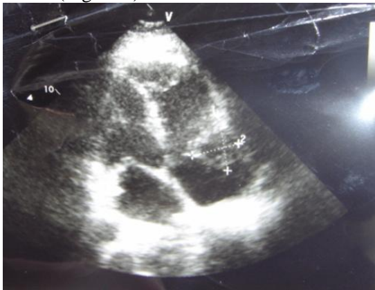
Figure 2: Transthoracic echocardiography showed a semi mobile mass 50x40mm in size in the right atrium

Transthoracic echocardiography confirmed a semi mobile mass 50x40mm in size in the right atrium (Figure 2).