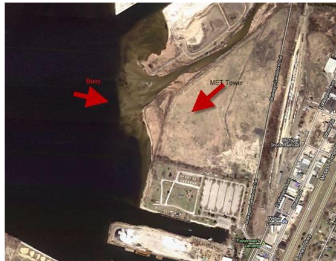
Fig. 1. Location of met mast and LWS unit in Muskegon Lake

The maximum wind speed of the two anemometers was used. Using the maximum, as opposed to the average, eliminates any erroneous data due to either A) one anemometer entering a failure mode; or B) differences in speed measurements due to differences in wind direction.