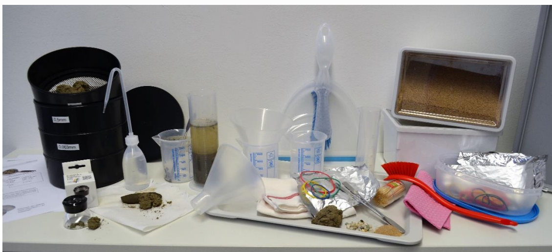
Figure 1. Contents of the GeoBox