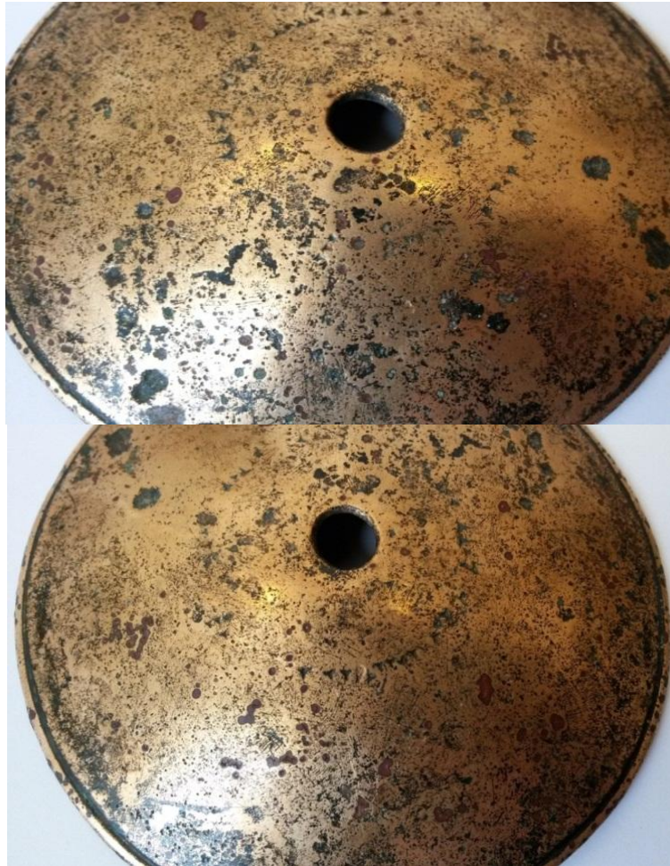
1. The bronze disc with Uartian inscription in Tabriz Museum