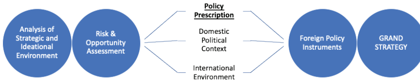
Figure 1. Designing Grand Strategy

States' domestic policies have increasingly become influenced by developments in their external environments, and these policies in turn influence foreign policy decisions. 9 The extent to which these two realms have come to be intertwined is almost unprecedented. Several factors are contributing to this trend, such as increasing interdependence among states, the U.S. emphasis on democratic government and human rights in the aftermath of WWII, and particularly in the post-Cold War era as a condition for the sovereign recognition of states, and an increasing number of non-state armed groups that regularly challenge states' authority, bringing about weak states that are vulnerable to third-party interventions. These developments have also led to the erosion of sovereignty as an organizing principle of interstate relations.