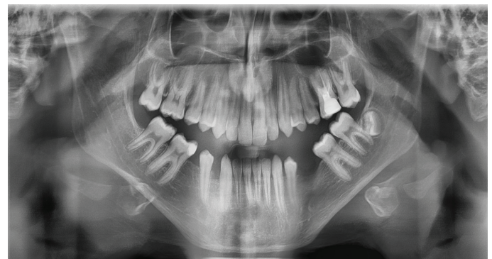
Figure 1. Hypodontia with M3 agenesis on panoramic radiographs.

One-hundred fifty-two patients who had congenital agenesis of M3 teeth were evaluated for hypodontia and oligodontia (Figures 1, 2). Hypodontia was detected in 37 (24.3%) pa-