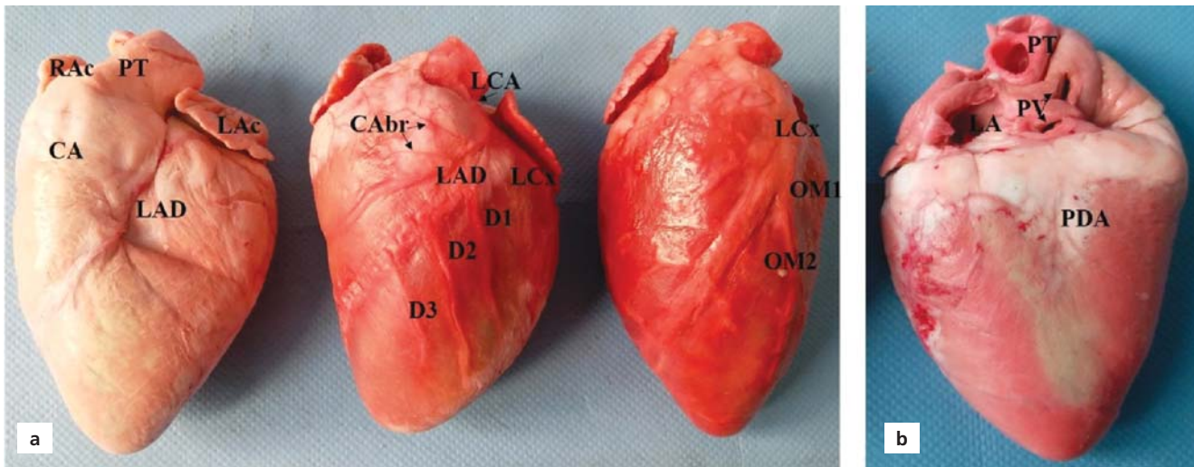
Figure 1. External aspects of the plastinated heart. (a) Anterior long-axis view. (b) Posterior view. CA: conus arteriosus; CABr: branches for conus arteriosus; D: diagonal branches; LA: left atrium; LAc: left auricle; LAD: left descending artery, LCA: left coronary artery; LCx: left circumflex artery; OM: obtuse marginal artery; PDA: posterior descending artery; PT: pulmoner trunk; PV: pulmoner vein; RAc: right auricle.

values, and frequency and percent for categorical variables. The Shapiro-Wilk test was used as a test of normality. The independent samples t-test was used for two independent group comparisons of normally distributed variables, and the Mann-Whitney U test was used for non-normal distributed variables. Statistical significance between the scores of the two groups was tested with one sample paired t-test, and post hoc Tukey test was used for multiple comparisons. A p-value <0.05 was considered significant.