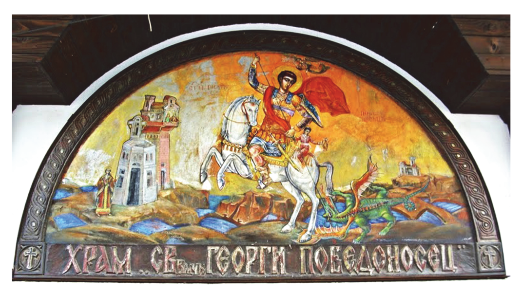
Fig. 6) Icon of Saint George at Sozopol

Whether or not such an addition to the martyr's name was intended from the beginning, but left out in the donor's inscription itself, is impossible to tell. As Walter points out in his study on