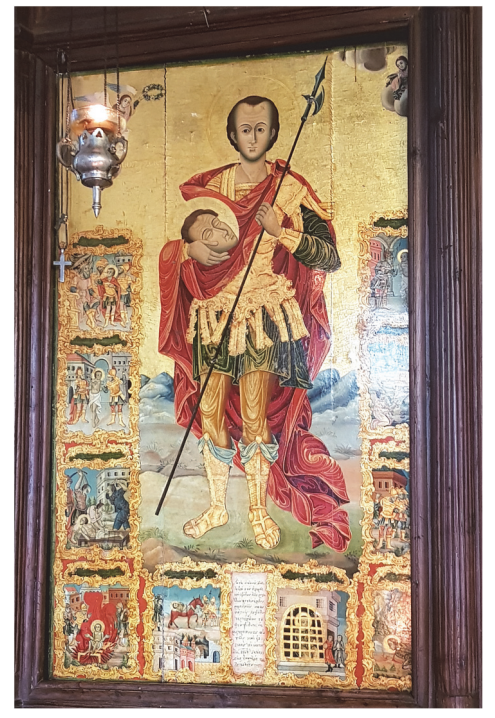
Fig. 7) Icon of Saint Zosimos at Sozopol

warrior saints, George is best known as τροπαιοφόρος, a definition closely related to his status as an army officer.91 Most images of the saint, including the iconography in his church in Sozopol, accordingly depicts him as victorious in battle and acting as a protector against evil.92 The notion of trophybearer seems to play an essential role in one specific iconographical type: the depiction as kephalophoros or "head-bearer", attested from the 16th century onwards.93 The "trophy" carried by him in this case is his own severed head, in accordance with popular martyrs' iconography.94 In Sozopol, however, the saint who holds his head in his hands is Saint Zosimos and not Saint George (Fig. 7). In local iconography, Saint George has been stylised as a victorious warrior, while Saint Zosimos has the iconography of the martyr saint, which was appropriate to the funerary function of his church. It is possible that at Sozopol the profiles of the saints might have been carefully adjusted in relation to one another.