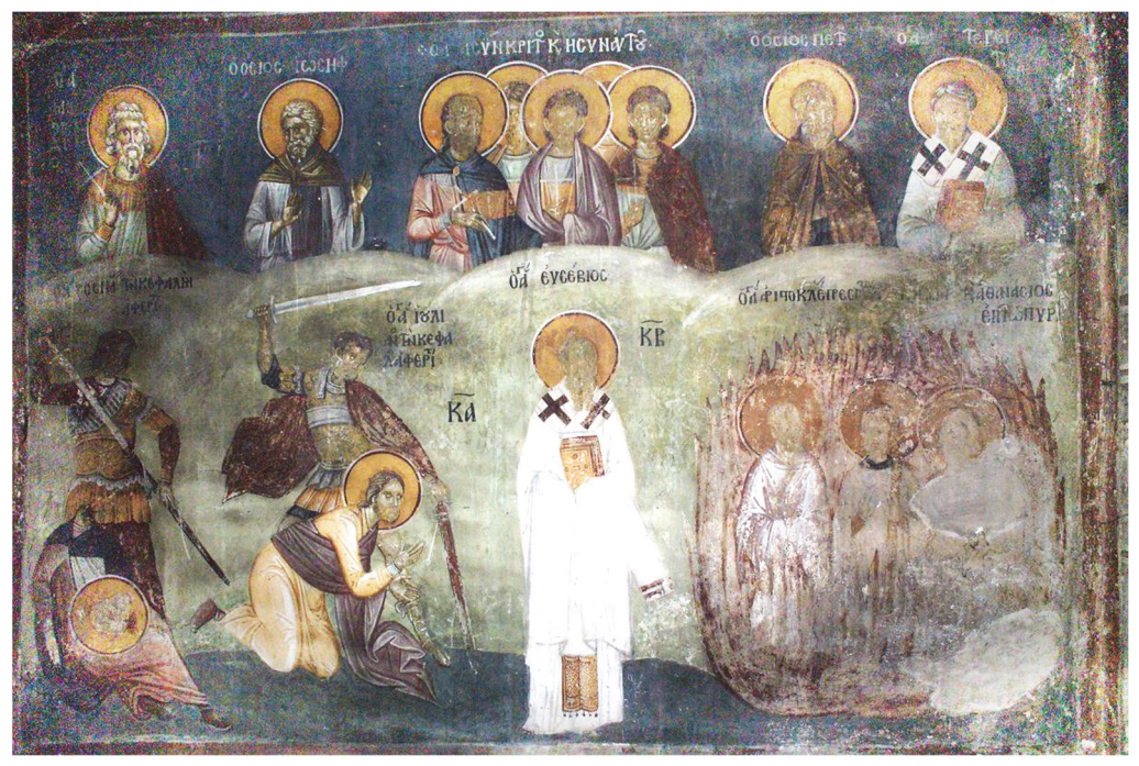
Fig. 2) Fresco of the Calendar of June at Gračanica

In the church of the renowned 14^{th} century monastery of Gračanica, located in modern Kosovo, the martyrdom of Saint Zosimos has been incorporated in the scenes from the northwest dome of the building, illustrating the saints' days in June of the Byzantine church calendar (Fig. 2). <sup>59</sup> The saint is depicted seated on the ground wearing civil clothing – a long tunic and cloak – at the moment right after the decapitation, with his head in a halo fallen onto his lap. Behind him stands a soldier who puts his sword back into the scabbard. Above the scene there is the legend: \dot{o} ἄγ(ιος) Z\dot{\omega}\sigma\mu(o\varsigma) τὴν κεφαλὴν ἀφαιρέθη ("The holy Zosimos who has been deprived of his head"). His martyrdom is represented at the bottom left corner of a wall decorated with the month's other martyrs and saints: On the top register we see (from left to right) Saint Methodius of Patara (20<sup>th</sup> of June), Saint Joseph, Saint Asyncritus and his companions (20<sup>th</sup> of June), Saint Peter, and Saint Terentius of Iconium (21<sup>st</sup> of June); on the lower register Saint Zosimos, Saint Julianus of Egypt, Saint Eusebius of Samosata (22<sup>nd</sup> of June), and the group of Saint Aristokles the presbyter, Saint Demetrianus the deacon, and Saint Athanasius the reader, condemned to the flames (23<sup>rd</sup> of June).