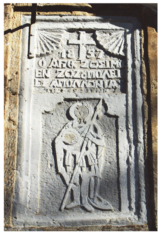
Fig. 5) Marble plaque above the entrance to the church of Saint Zosimos at Sozopol

the work of the famous Greek sculptor Kalamis, which was later carried off by Marcus Lucullus to Rome.<sup>74</sup> The name change in late antiquity must have been motivated by the adoption of Christianity. The 'defeat' that Apollo suffered in this city in the course of its Christianisation is symbolised by a votive inscription to Apollo, re-used as a spolium in an early Christian basilica on the island of Saint Kirik<sup>75</sup> where his temple is supposed to have existed.<sup>76</sup>