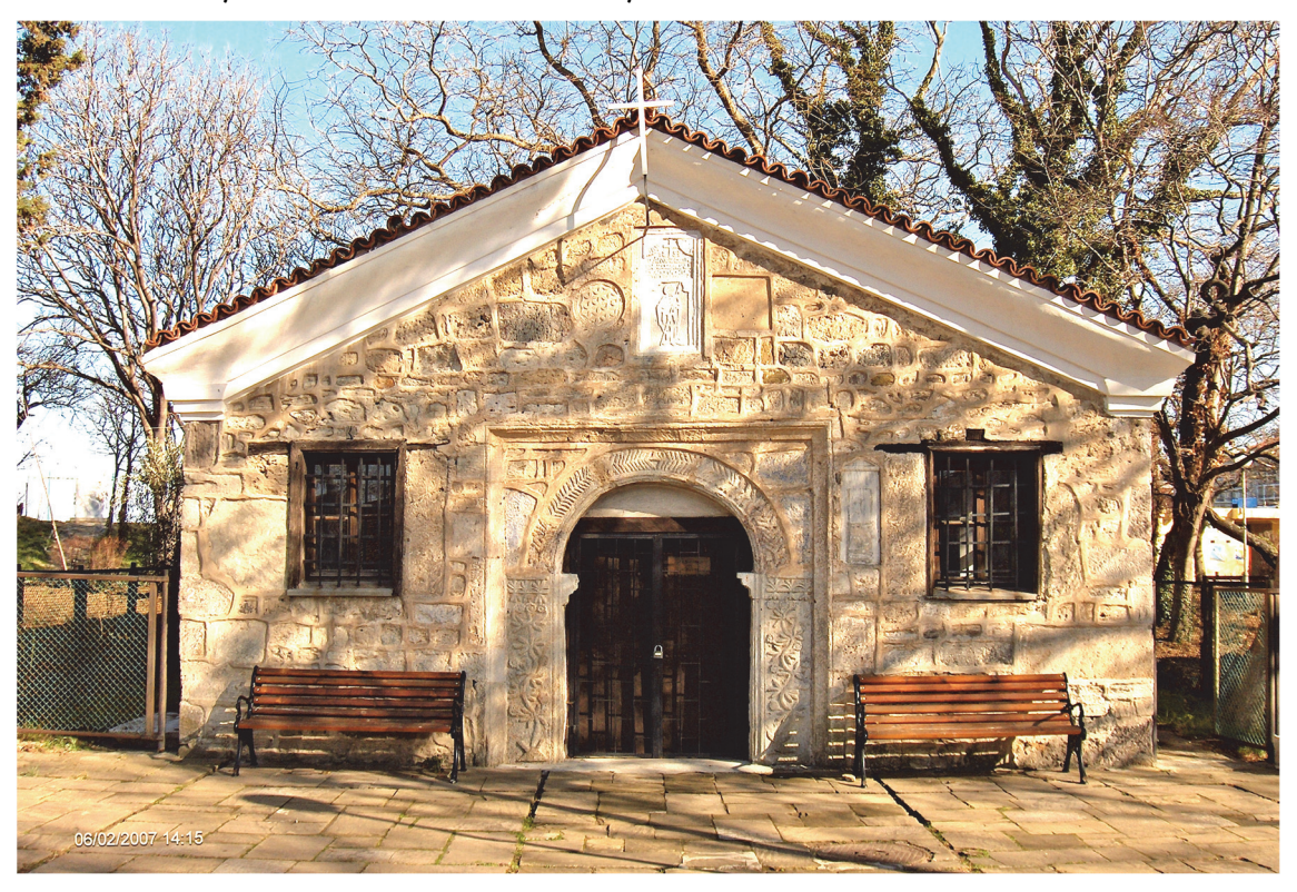
Fig. 4) View of the church of Saint Zosimos at Sozopol

This not only provides information about the exact date of the agreement to build the church, its facilities and infrastructure, but also gives the names of the members the committee who oversaw the project. Almost all the names of the sponsors and builders are Greek, and the cult was closely linked to the city's Greek Orthodox community.