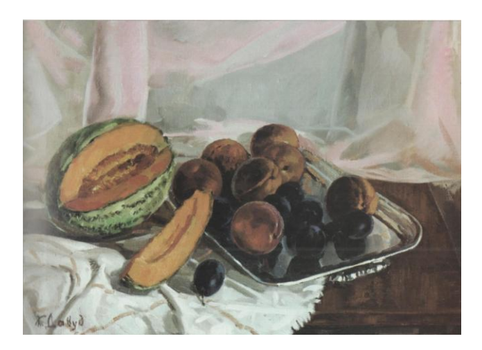
Photo 1. Melon and fruits, 1988, canvas, oil. 50x70 cm.. Collection of artist's family