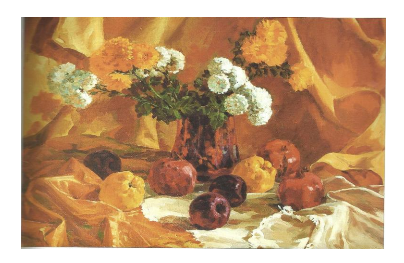
Photo 4. "Fruits and flowers", 1990, canvas, oil. 90x100 cm. Private collection