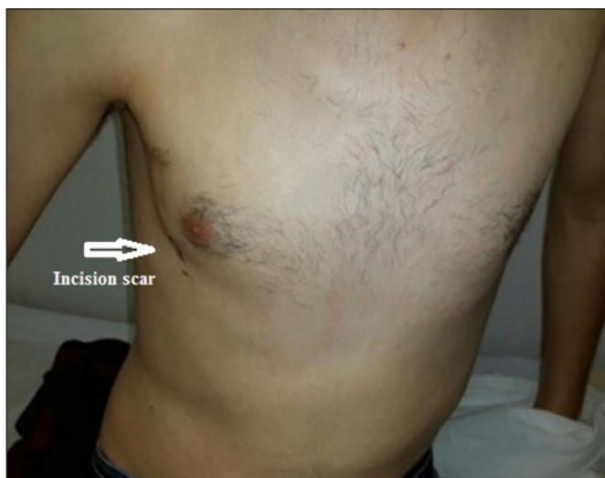
Figure 4. The cosmetic result of the postoperative incision