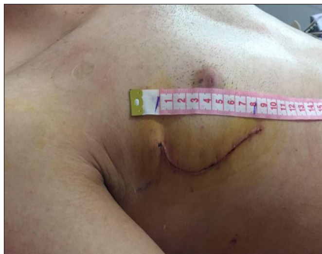
Figure 3. Thoracotomy skin incision