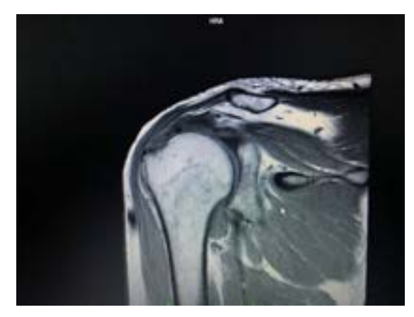
Figure 1. On the MRI, the SLAP lesion was not detected